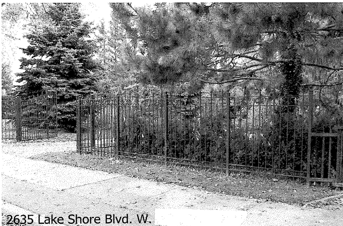
2635 Lake Shore Blvd. W. [REDACTED] (Looking east @ encroaching section)