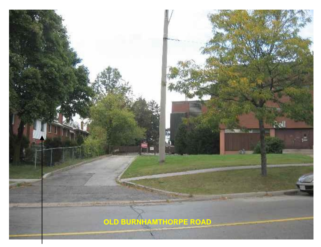
Townhouse Complex at 46-52 Old Burnhamthorpe Road