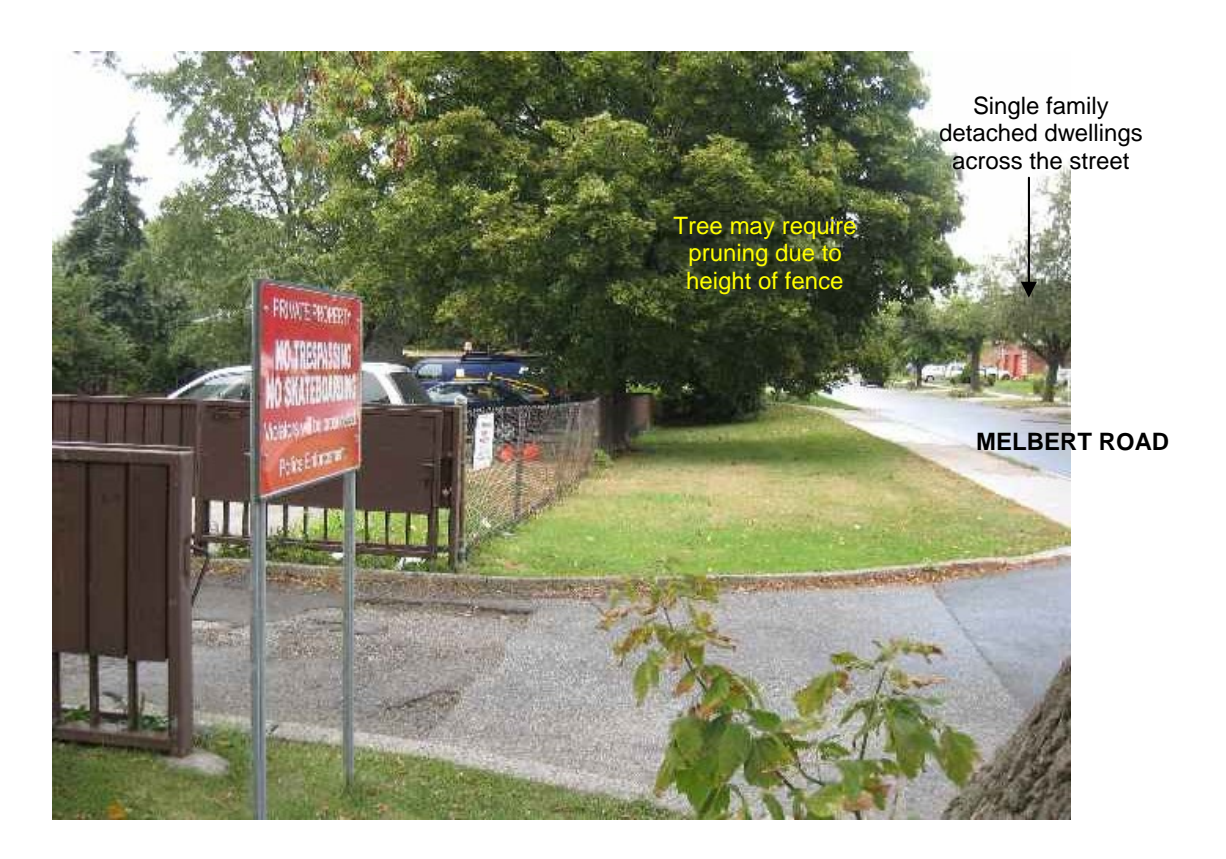
Attachment 4: Photographs showing the existing fence at Melbert Road