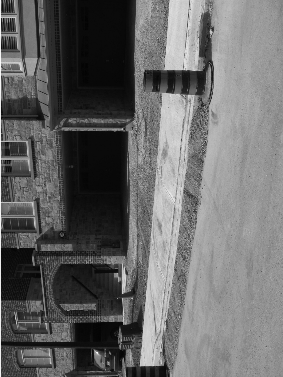
Typical Curb Cut As Currently Approved