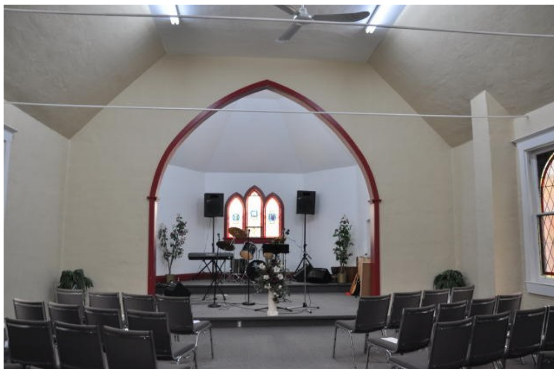
Interior, St. Matthias Anglican Church, 2009 (view to east)