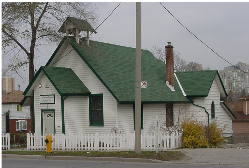
Exterior, St. Matthias Anglican Church, 2002