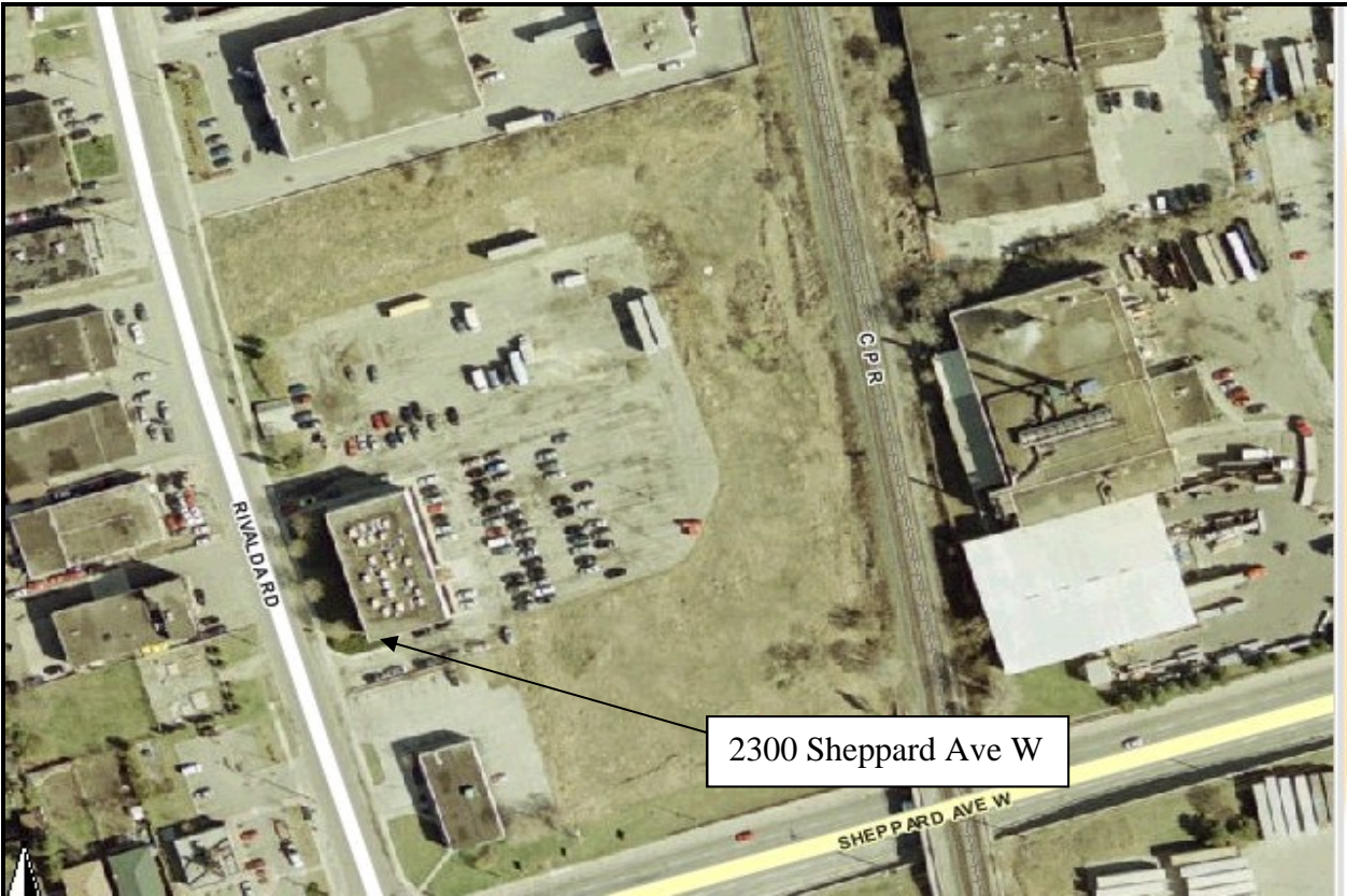
Appendix "B" Lease Agreement - 2300 Sheppard Avenue West