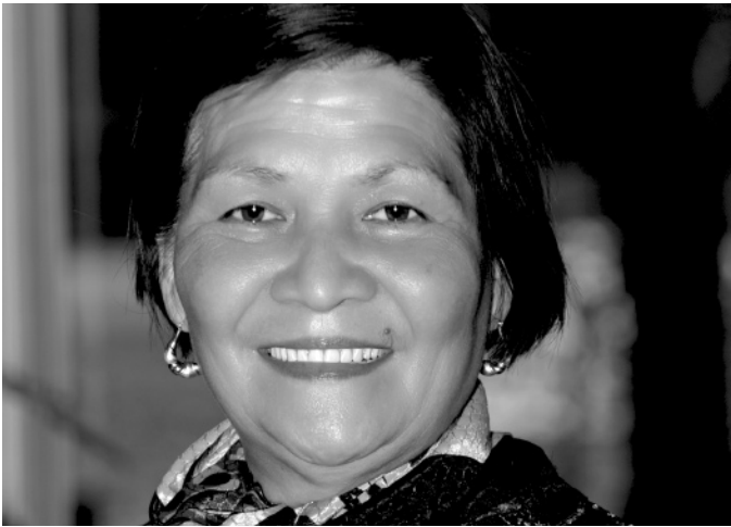
Brenda Semblante Fudger House

Volunteers become our partners-in-care and reinforce our commitment to providing care and services that respect, support and enable our clients and residents.