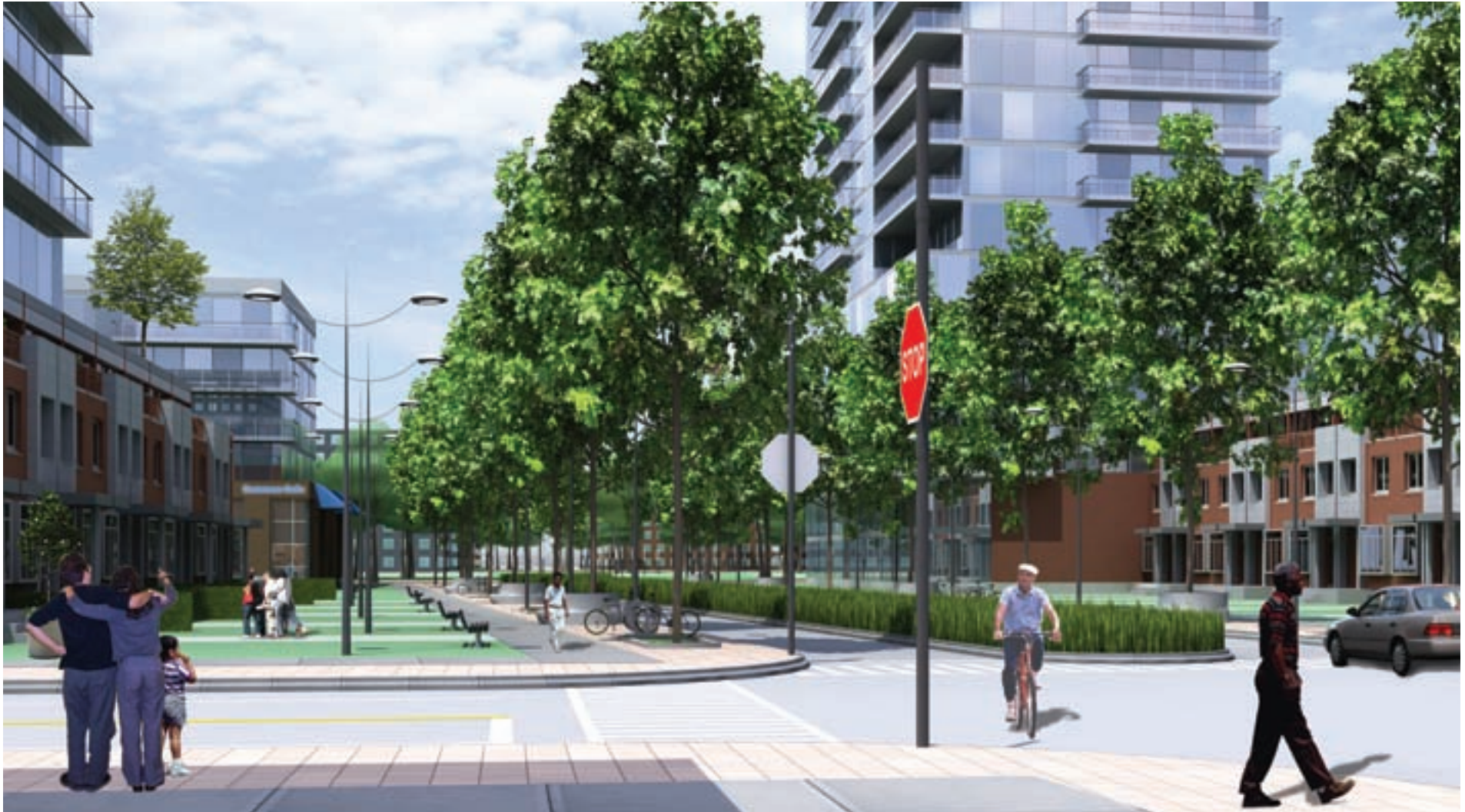
Illustration looking north on Replin Road - Rendering produced by Sweeny Sterling Finlayson & Co Architects Inc.