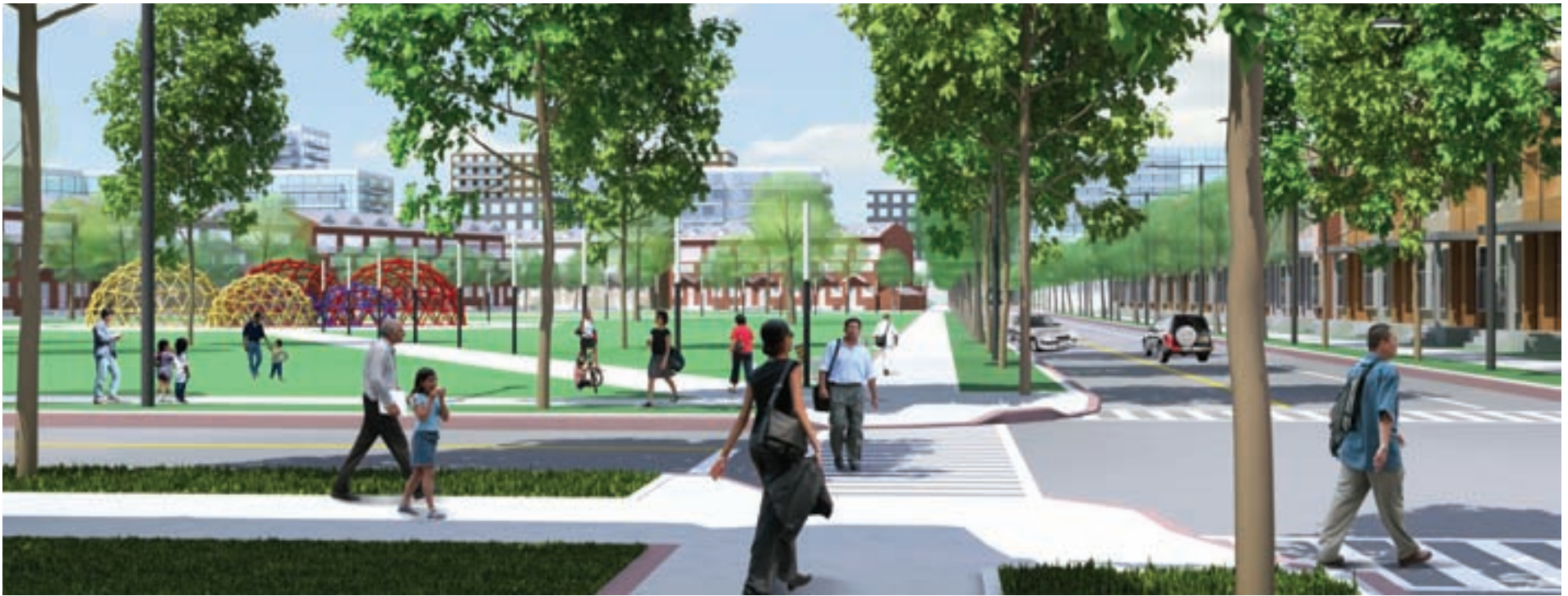
Illustration looking west to the northeast Neighbourhood Park - Rendering produced by Sweeny Sterling Finlayson & Co Architects

The new streets included in the Revitalization Plan are to provide enjoyable and comfortable spaces for pedestrians and public activity, as well as transit and vehicular use. A network of public streets establishes a hierarchy of different street types and address for new buildings. The Plan replaces the existing ring road in Lawrence Heights with a new north-south and a new east-west Primary Street. Streets are designed to support a well-balanced transportation system and to connect Lawrence Heights to surrounding neighbourhoods and to the larger city, counteracting the historical isolation of the neighbourhood. The streets provide clear and direct travel routes between important destinations in the area and provide connectivity with the surrounding community and the broader city street network.