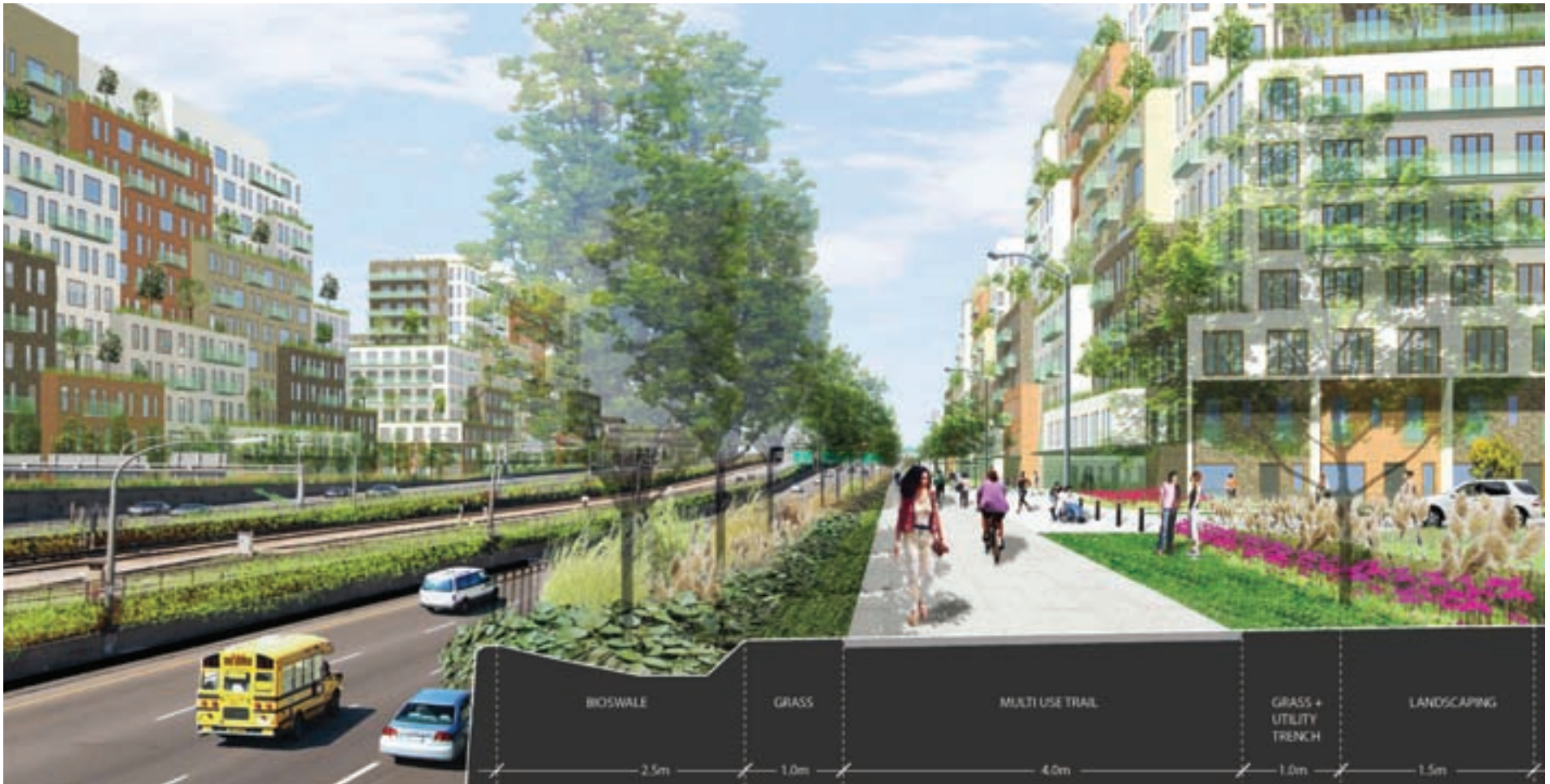
Illustration looking north on the Greenway next to Allen Road - Rendering produced by planningAlliance