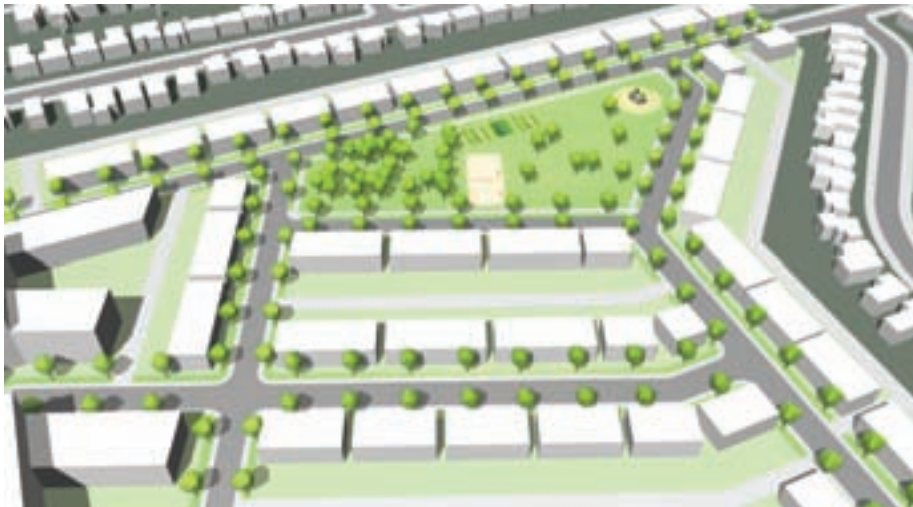
Bird's eye view - Northeast Area - 3D model produced by planningAlliance