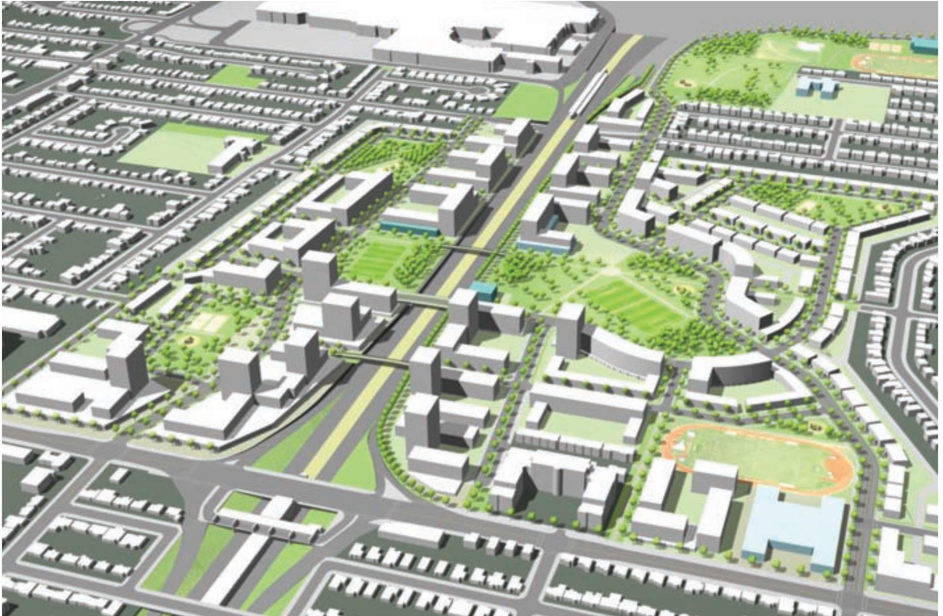
Figure 9: Bird's eye view of Revitalization Plan in the Focus Area - 3D model produced by planningAlliance