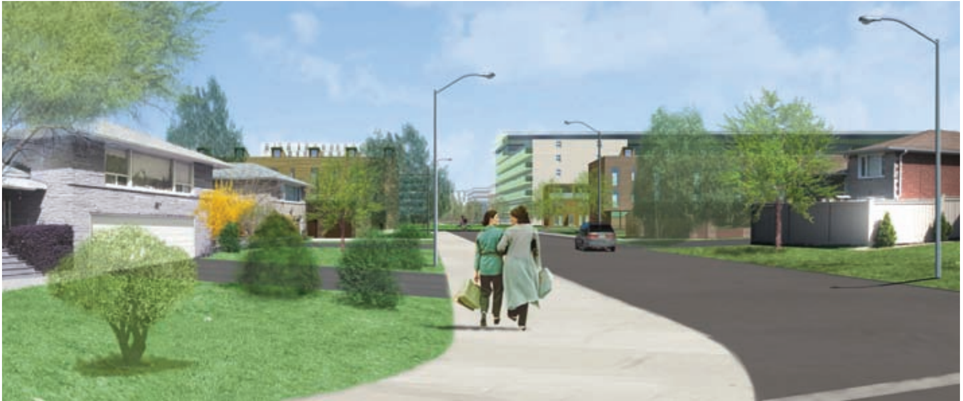
Illustration looking east on Stockton Road - Rendering produced by planningAlliance