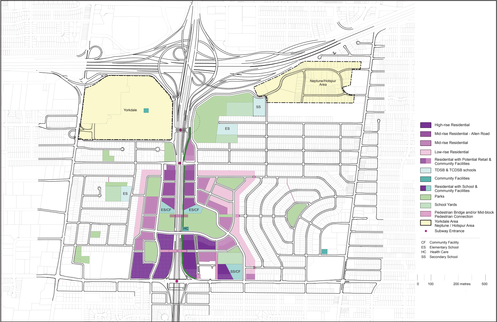
Figure 12: Lawrence-Allen Revitalization Plan