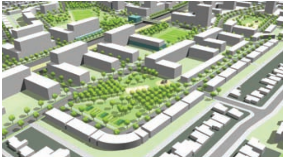
Bird's eye view - West Area - 3D model produced by planningAlliance