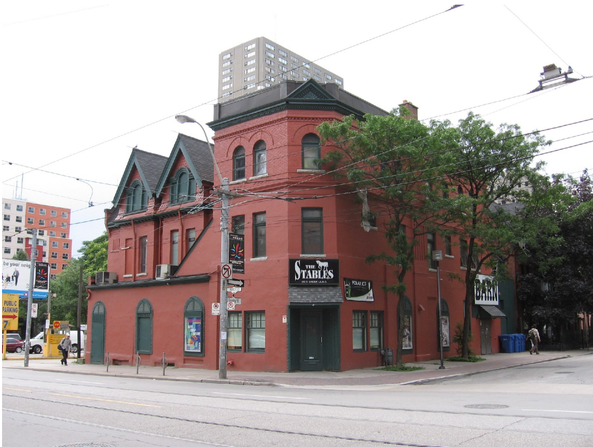
Stephen Murphy Houses and Store on the southwest corner of Church Street and Granby Street, showing the east (left) and north (right) facades and the chamfered corner tower with an entrance.