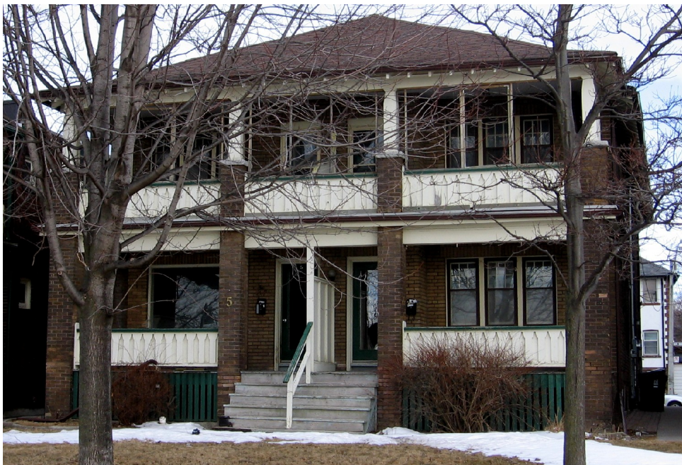
Fourplex at 5-7 Hubbard Boulevard