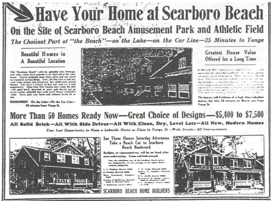
Staff report for action – Hubbard and Wineva Properties – Inclusion on Heritage Inventory