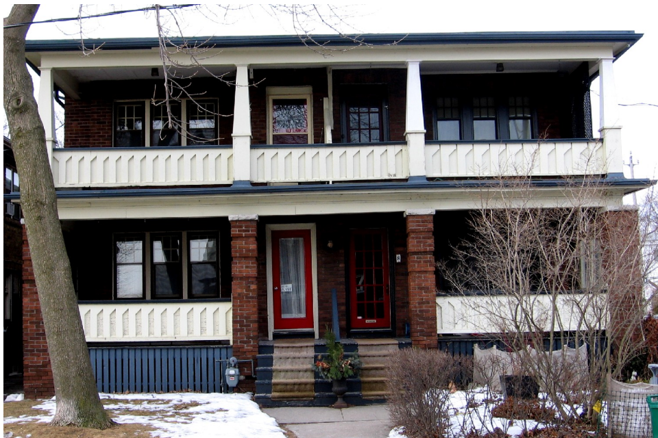
Fourplex at 6-8 Wineva Avenue