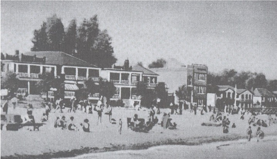
Historical view of the properties at 1-15 Hubbard Boulevard, c. 1929