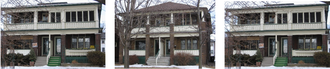
Above, left to right: Fourplexes at 1-3, 5-7 and 9-11 Hubbard Boulevard