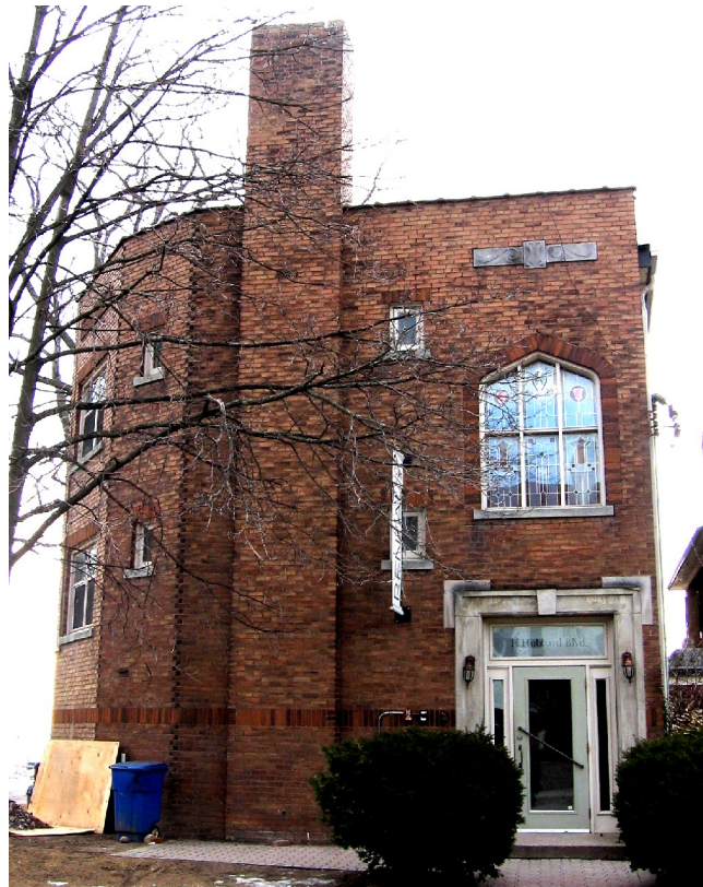
Rear (north) wall with north entrance (right) and bevelled northeast corner (left)