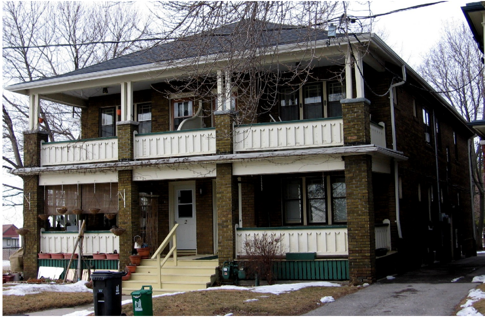
Fourplex at 2-4 Wineva Avenue