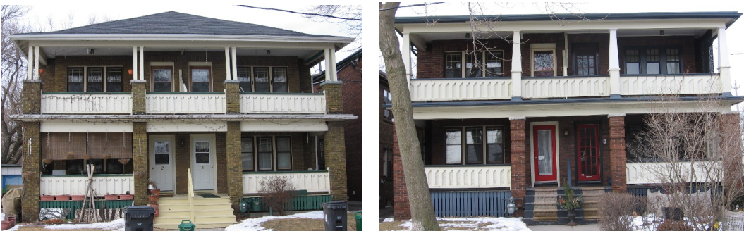
Fourplexes at 2-4 (left) and 6-8 (right) Wineva Avenue