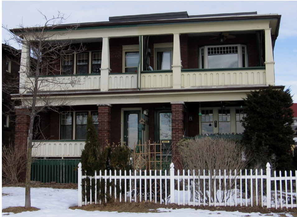
Fourplex at 9-11 Hubbard Boulevard