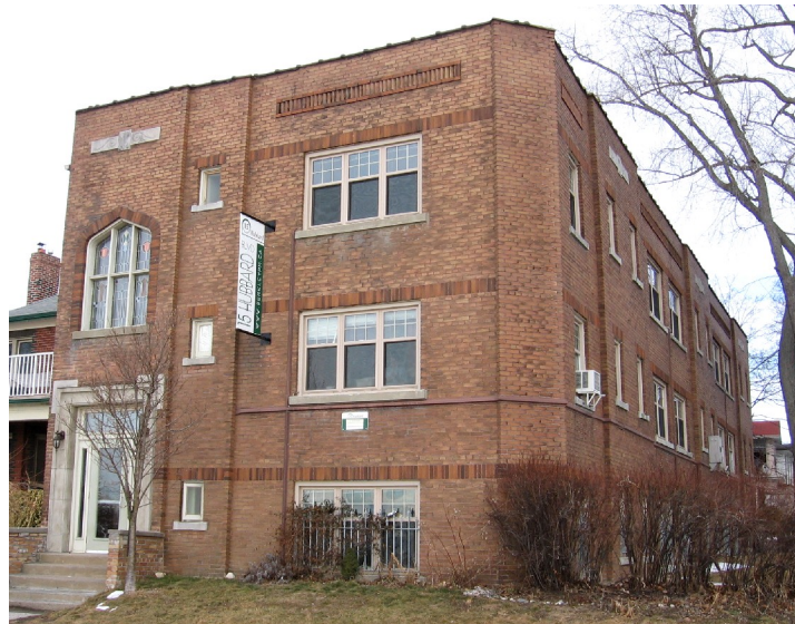
Hubbard Court Apartments, showing the principal (south) façade (left) and east elevation (right)