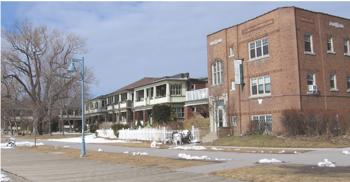
View of the subject properties on Wineva Avenue (left) and Hubbard Boulevard (right), with the Boardwalk in the foreground.