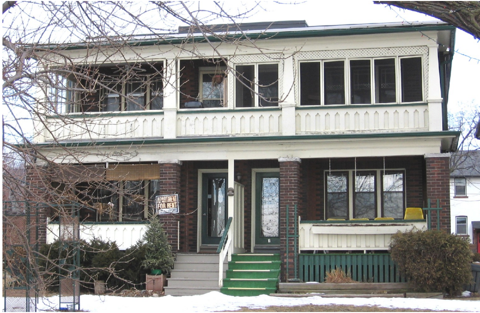
Fourplex at 1-3 Hubbard Boulevard