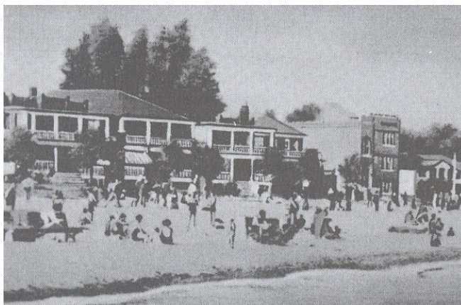
Hubbard Boulevard, between Wineva and Hammersmith, c.1929