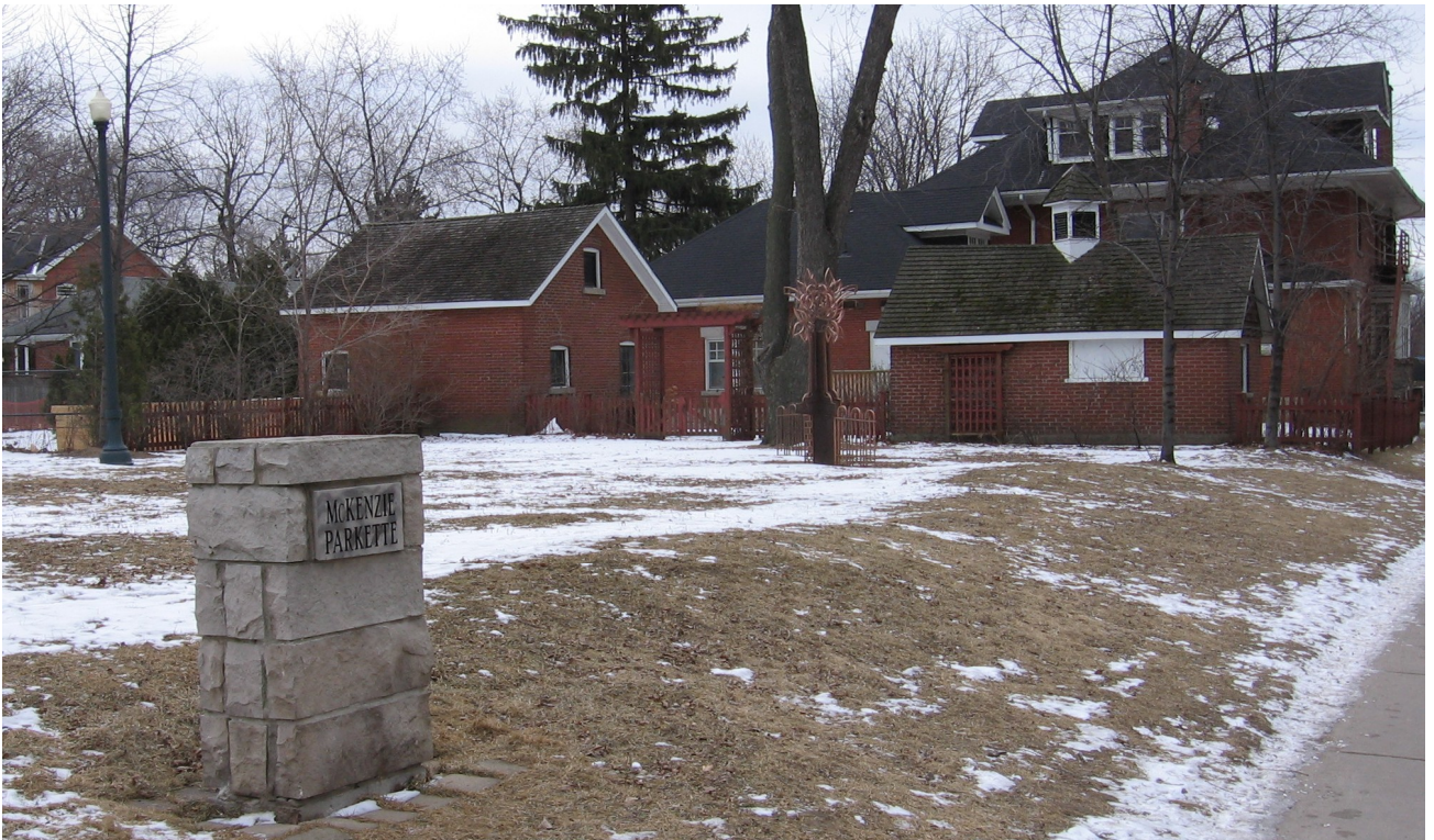
McKenzie Parkette, looking south and showing the Stable (left) and Milk House (right), with the John McKenzie House and Carriage House in the background