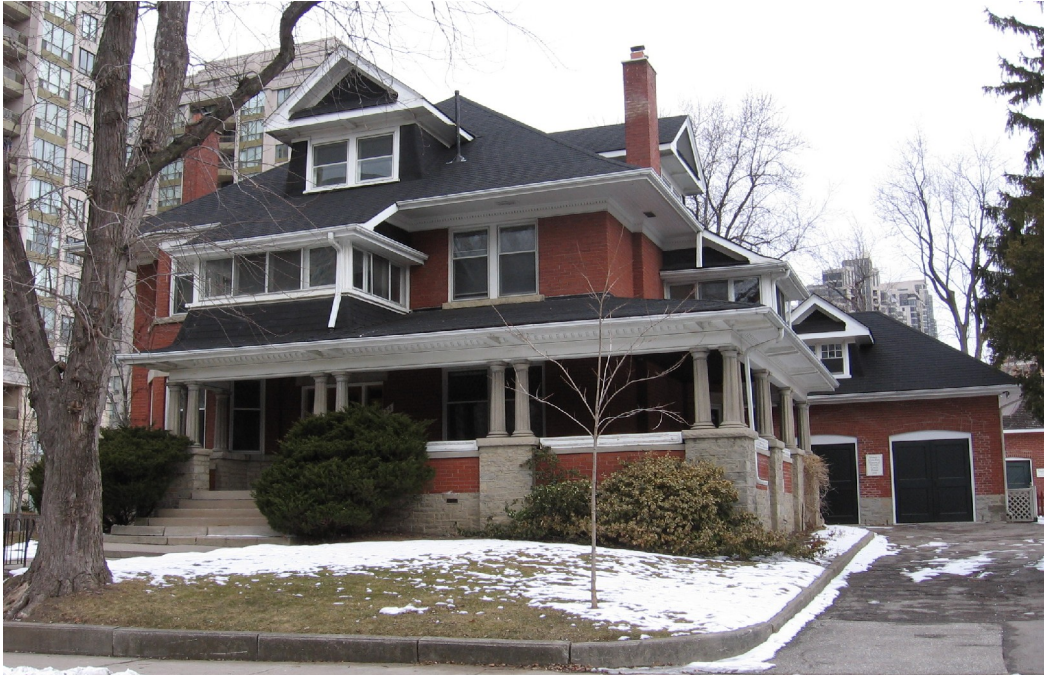
Principal (south) façade of John McKenzie House and attached Coach House (right)