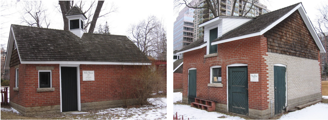
Milk House (left) & Stable (right), showing principal (south) façades