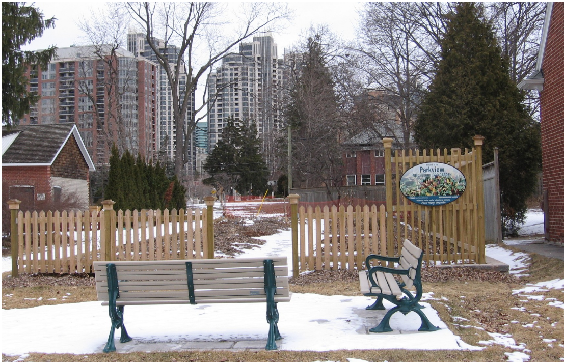
View of community garden located east of John McKenzie House, with Stable on left (west) and McKenzie Parkette behind (north)