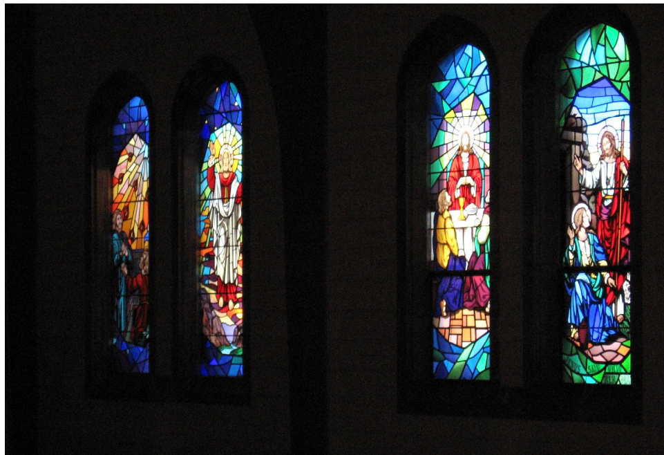
Interior view, showing some of the stained glass windows along the north wall of the sanctuary