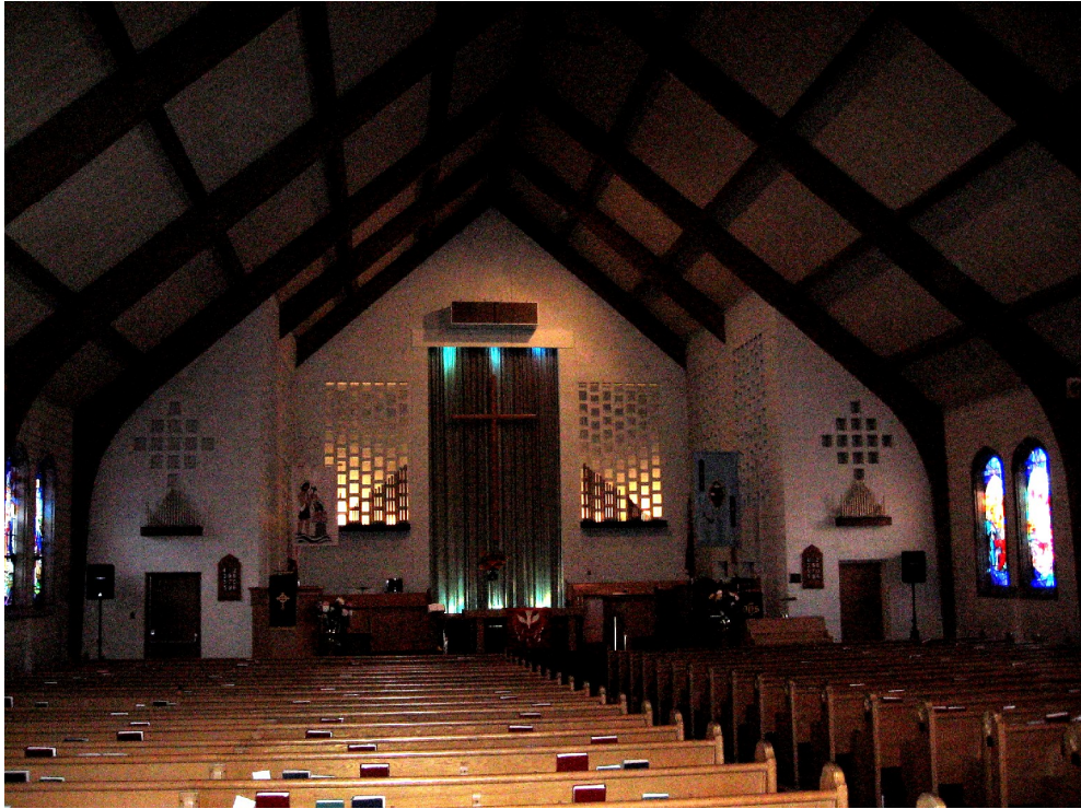
Interior view of the sanctuary, looking west and showing the roof structure and decoration on the west wall of the chancel