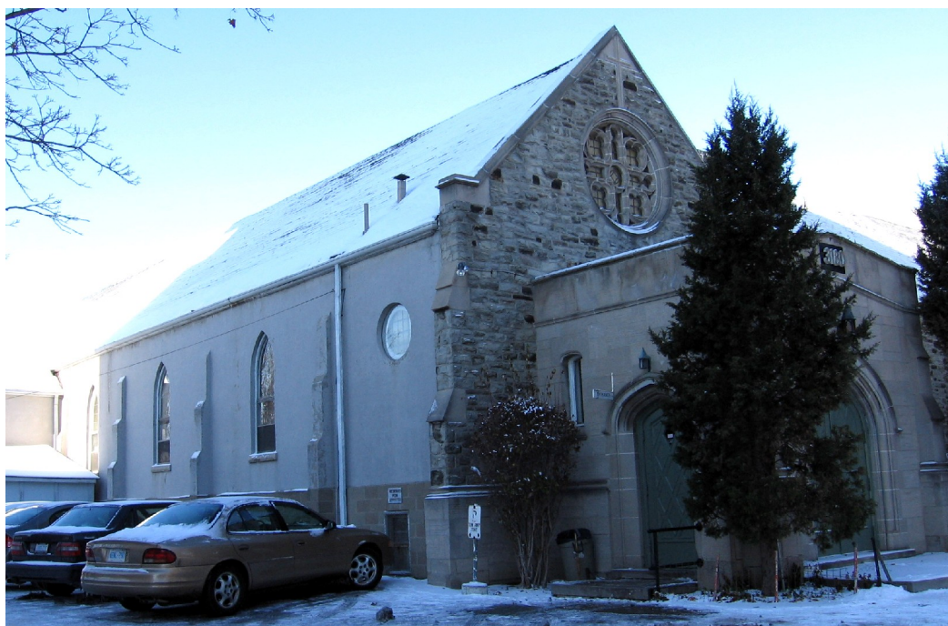
View of the south wall (left) of the 1899 church, which has been incorporated into the 1950s alterations to the complex