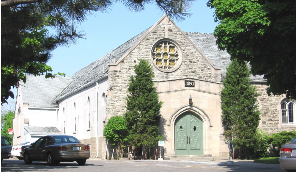
View of the east wall of the church complex, showing the south wall of the 1899 church (left) and the 1951 narthex (right)