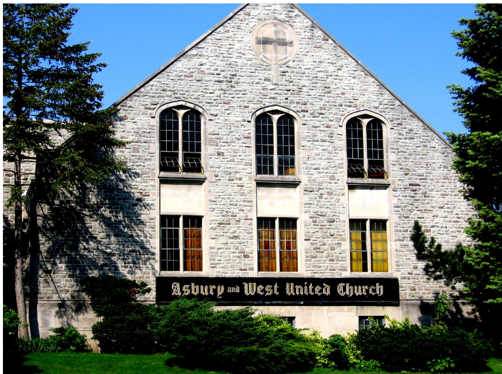
View of the principal (east) façade of the sanctuary, dating to 1958