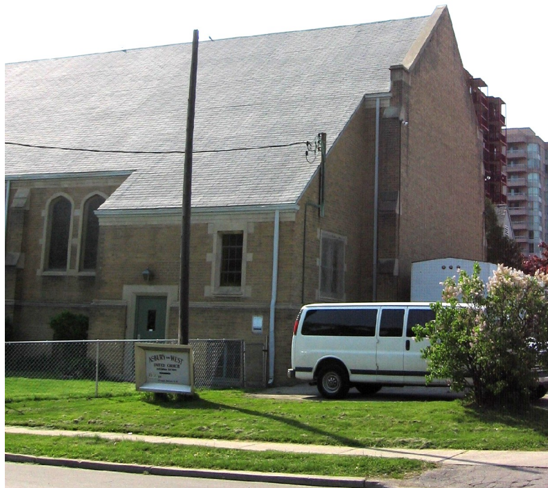
View of the north elevation (left) and the rear or west wall (right)