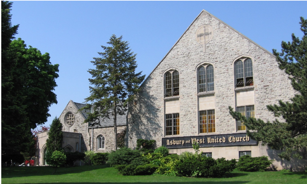
Exterior view of the east façade of the sanctuary of Asbury and West United Church (right)