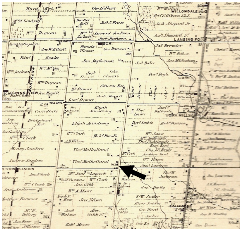
Extract, Historical Atlas of York County , 1878, showing the location of the original Asbury Wesleyan Methodist Church (marked “WM” on the map). The current complex is located one lot to the north on land also owned by the Mulholland family in the late 19 th century