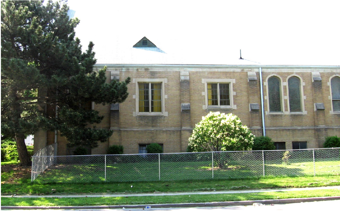
View of part of the north elevation of the church, showing the brick cladding, brick and stone detailing, buttresses and fenestration