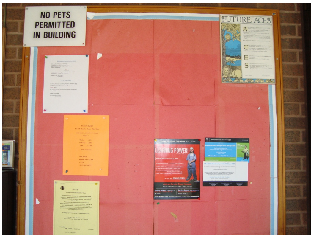
Figure 7 Example of an existing public bulletin board from Earl Bales Park