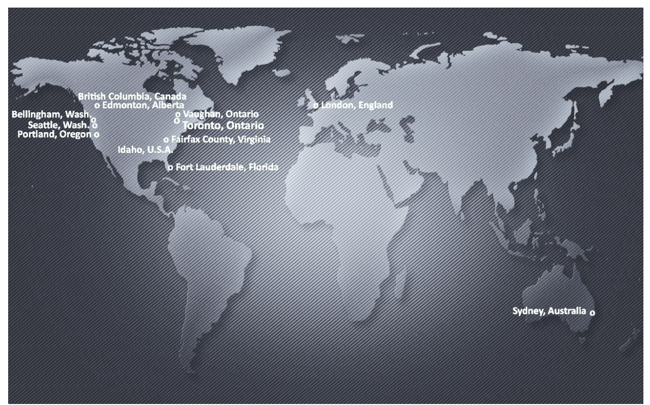
Figure 1 External Case Studies Context Map

This study will draw on eleven case studies of parks classification systems in Canada and abroad. These include two case studies of parks classification on the state wide or provincial level, and nine at the municipal level in cities of varying sizes. These range in proximity to Toronto from Vaughan, a nearby municipality, to Sydney, Australia (Figure 1). Cases were selected based on the inclusion or absence of elements, such as a classification system for parks, citizen engagement, and promotion. rParc believes that these elements can be used to help improve Toronto's parks classification system.