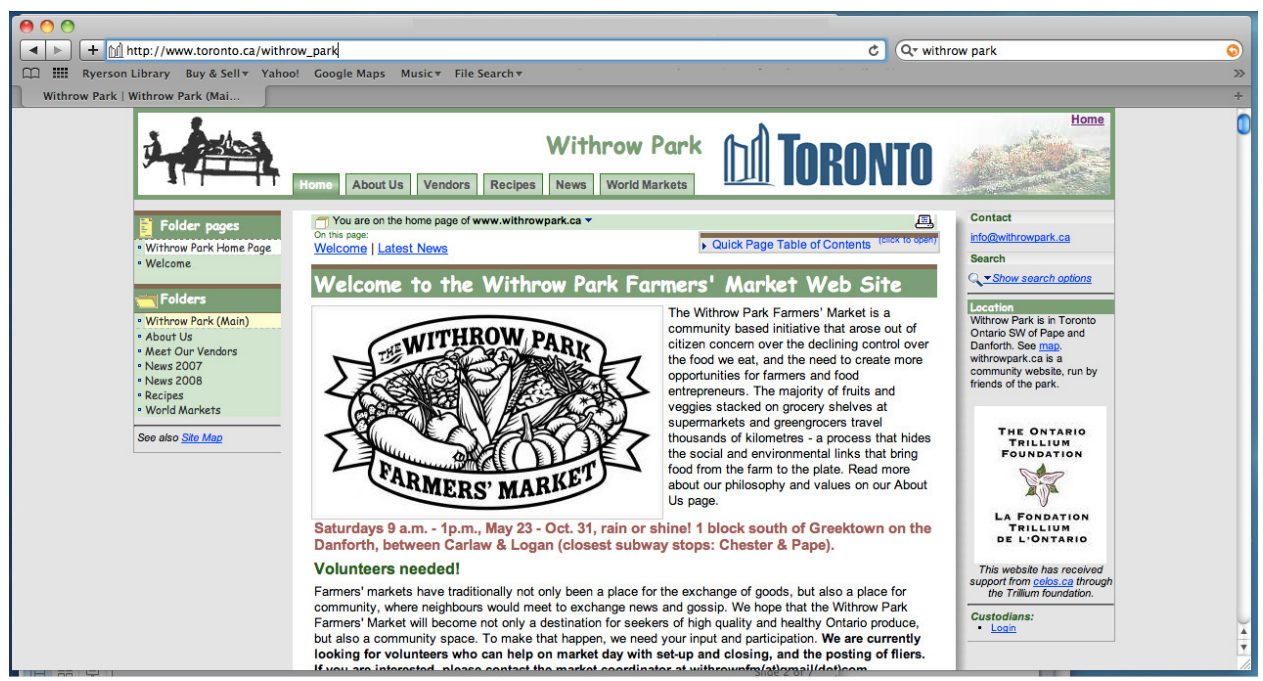
Figure 2 Example of community web space