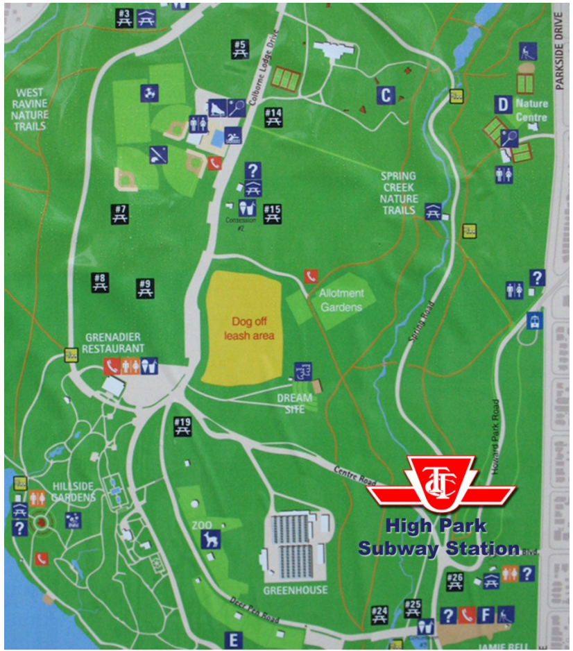
Figure 5 Example of improved signage in parks

Various methods should be used to establish the park signage system, which will be designed to strengthen the physical and social relationship between users and the park. Ultimately, park users will find improvements in the identification of parks and in their ability to obtain useful information to facilitate meaningful engagement in parks. Signage will vary between park types as seen below.