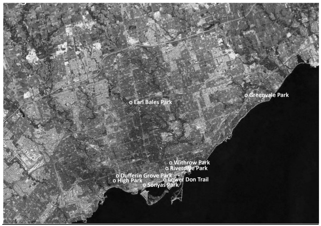
Figure 1 Toronto Park Profile Context Map