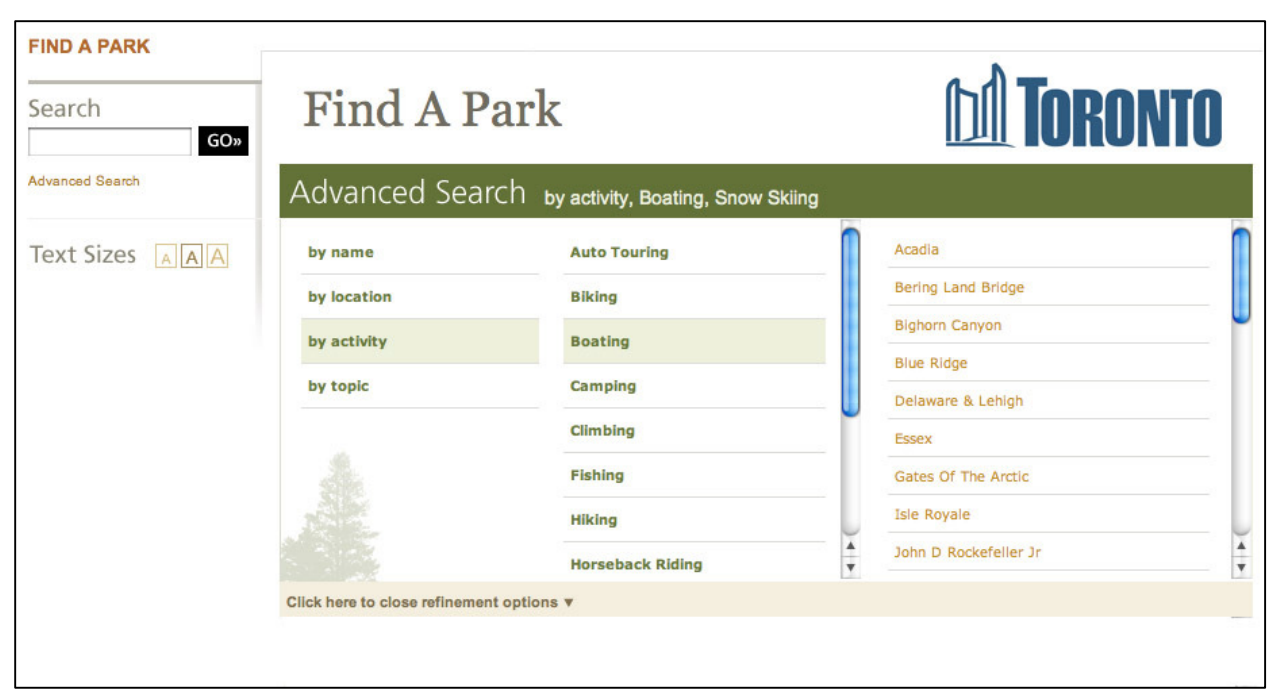
Figure 3 Example of a park amenity search database system