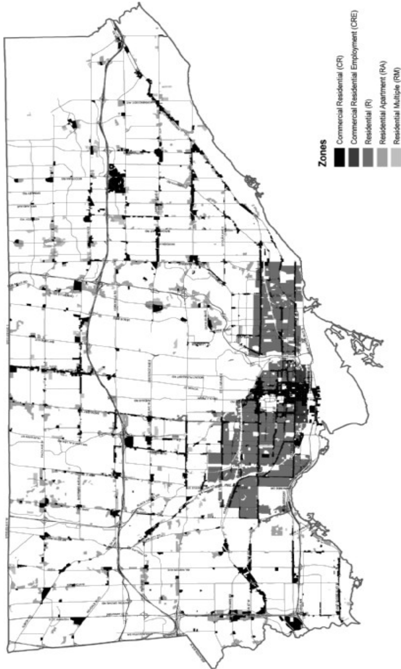
TORONTO City Planning MAP 2: Zones in the New Draft Zoning By-law That Would Permit Rooming Houses Not to Scale 12/18/2008