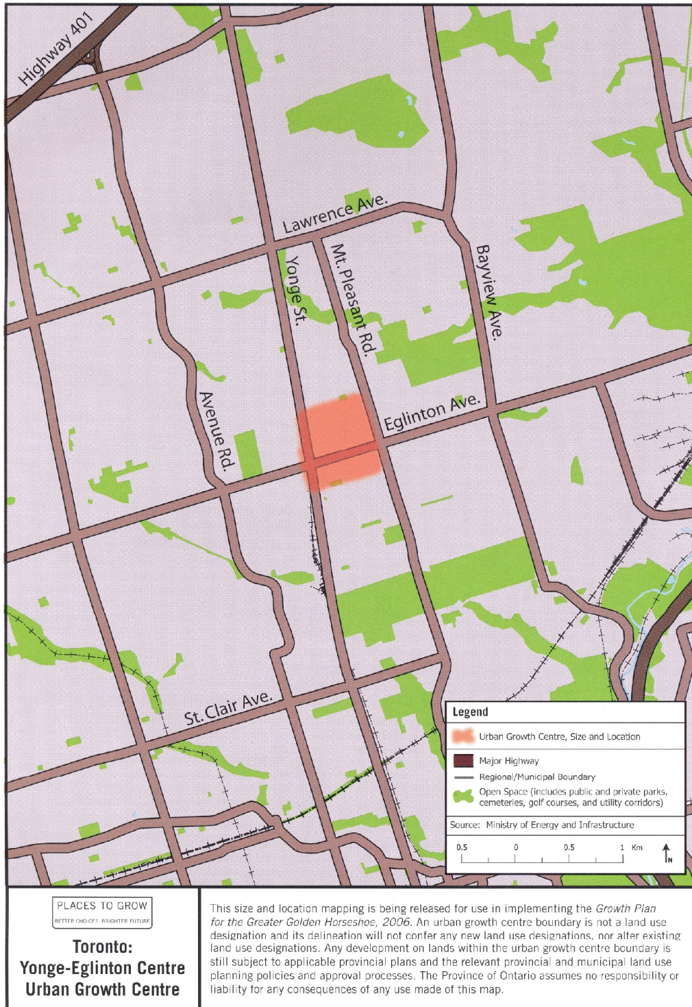
Size and Location of Urban Growth Centres in the Greater Golden Horseshoe