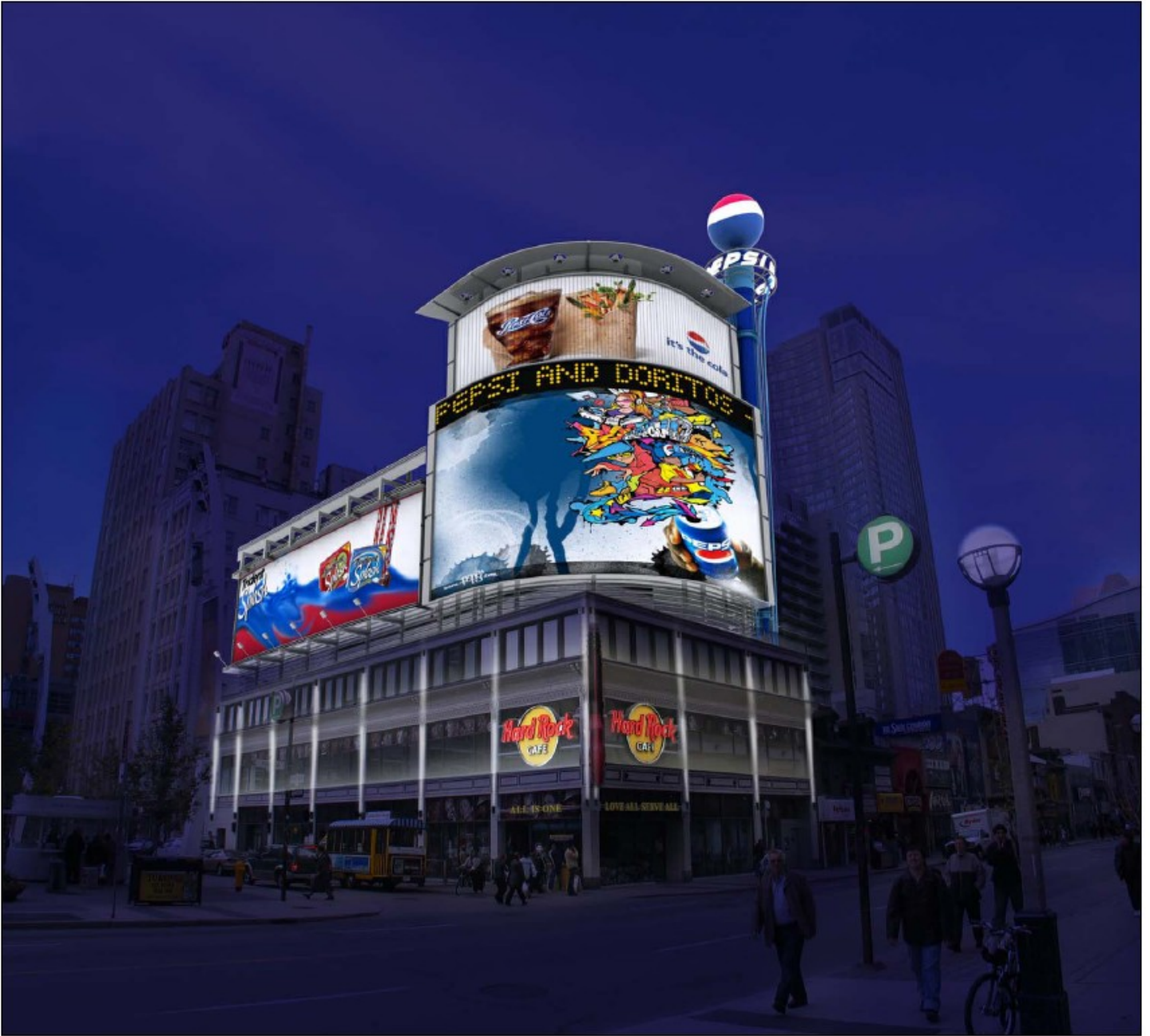
1 View From Eaton Centre Looking Southeast Yonge Street - Proposed W2.0-69 NTS