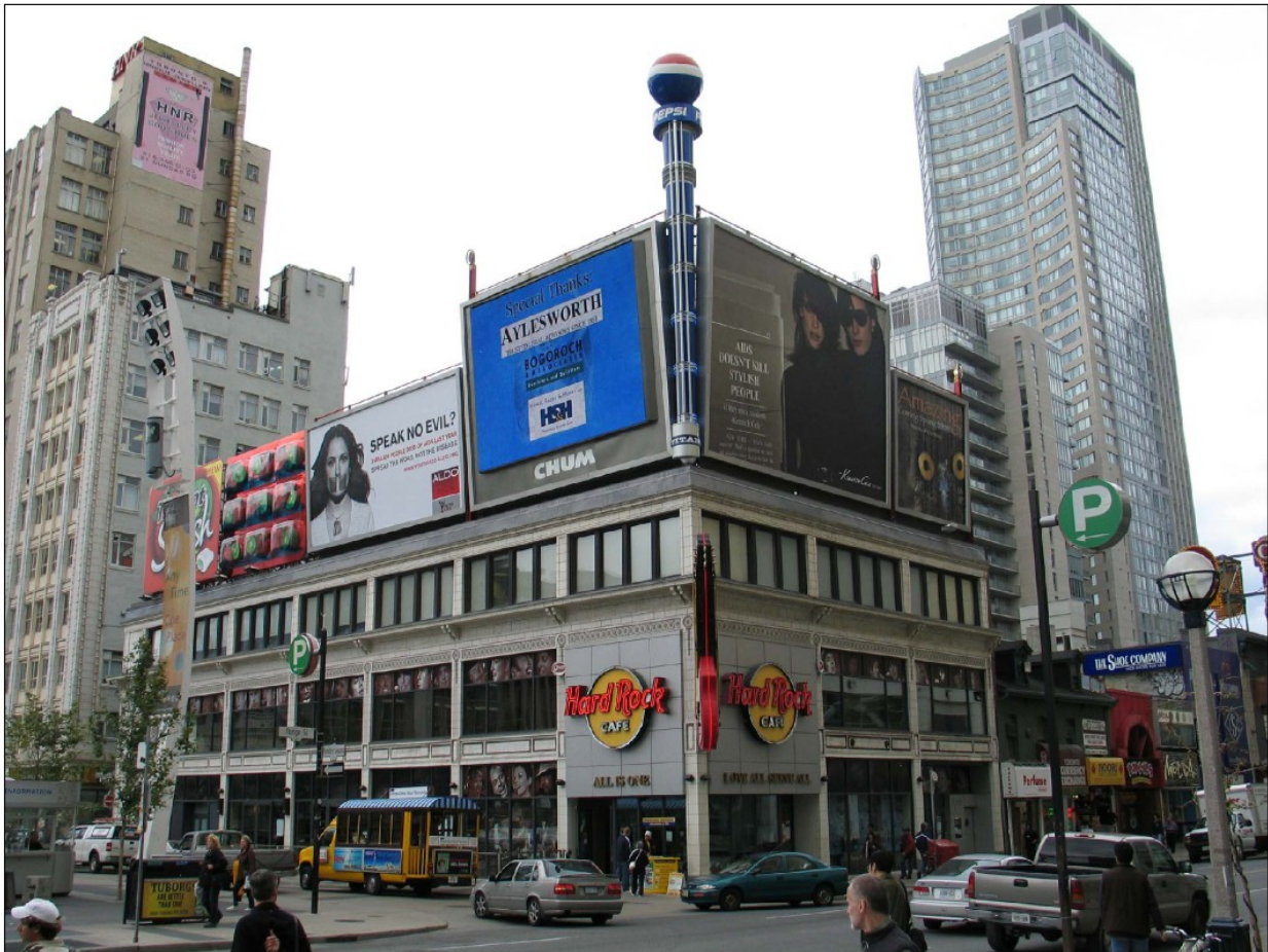
1 View From Eaton Centre Looking Southeast Yonge Street - Existing Conditions W2.0-59 NTS