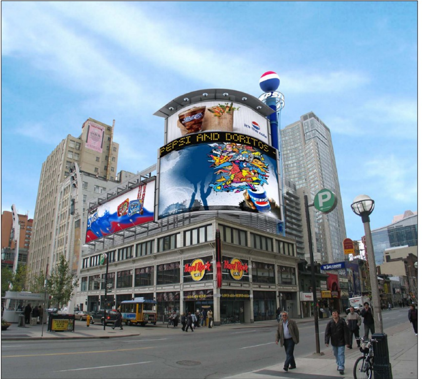
1 View From Eaton Centre Looking Southeast Yonge Street - Proposed W2.0-6 NTS