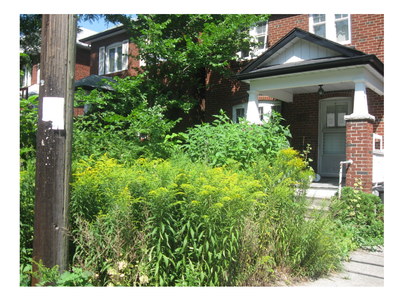
Attachment 1, Photo of Front Yard