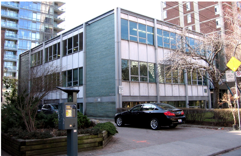
East elevation (left) and principal (north) façade (right)