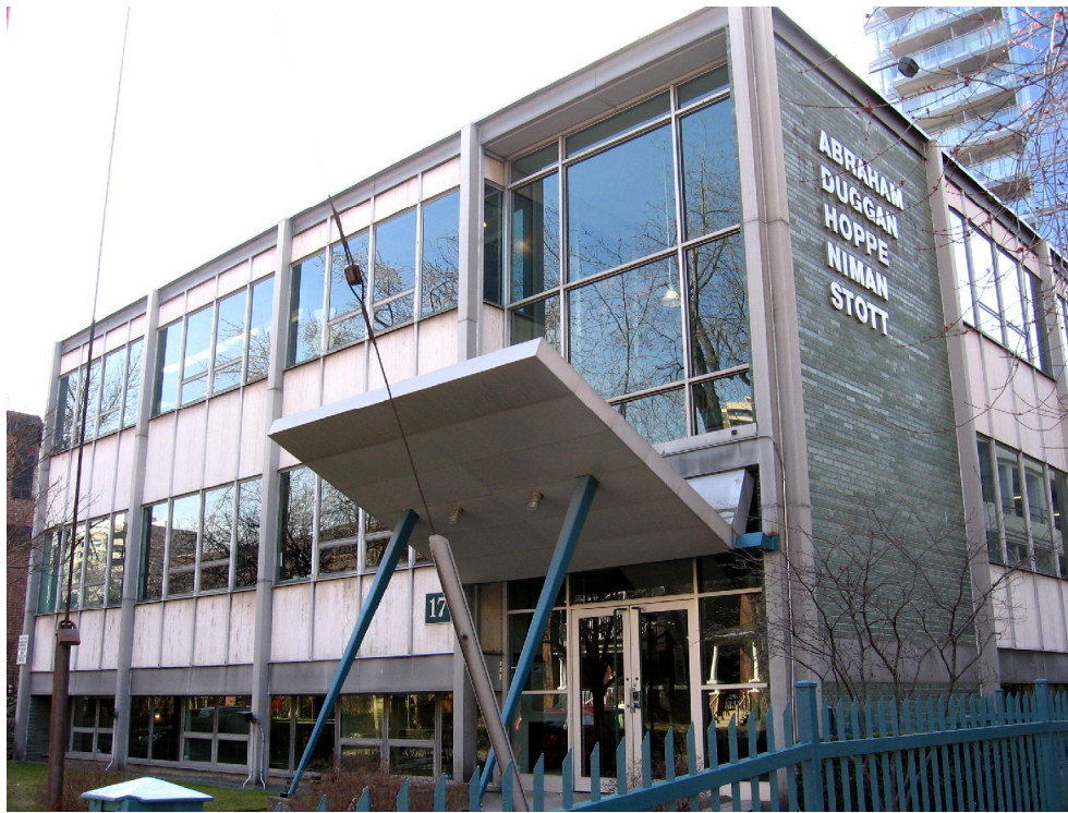
Principal (north) façade (left) and west elevation (right)