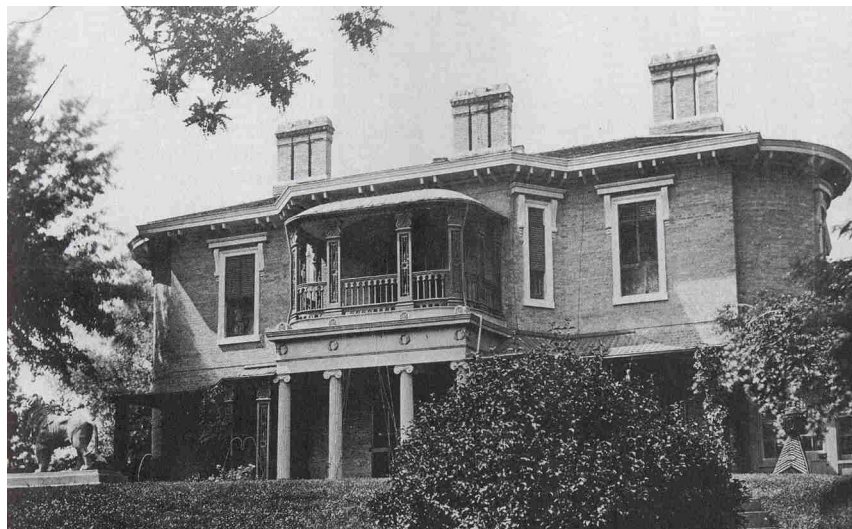
"Dundonald", which was demolished in the early 1900s when a residential subdivision was registered on the estate and Dundonald Street was laid out (source: Lundell, The Estates of Old Toronto , 1998, 53)