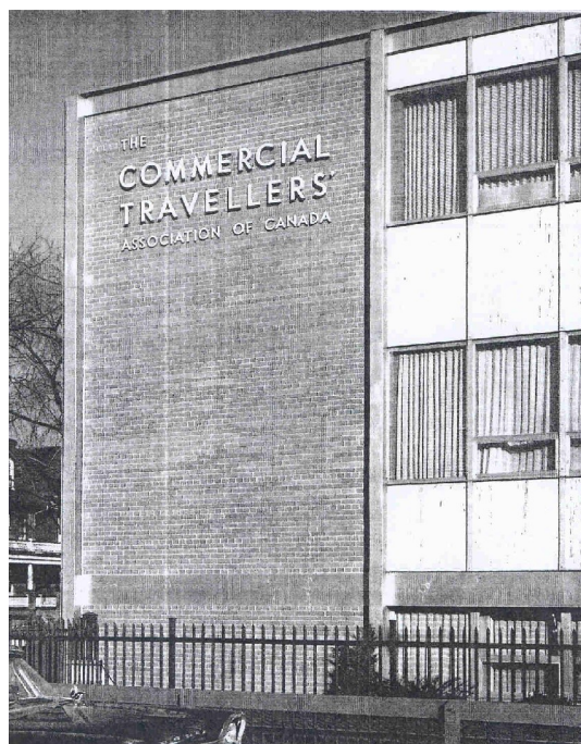
Commercial Travellers' Association of Canada Building, west elevation, c. 1960