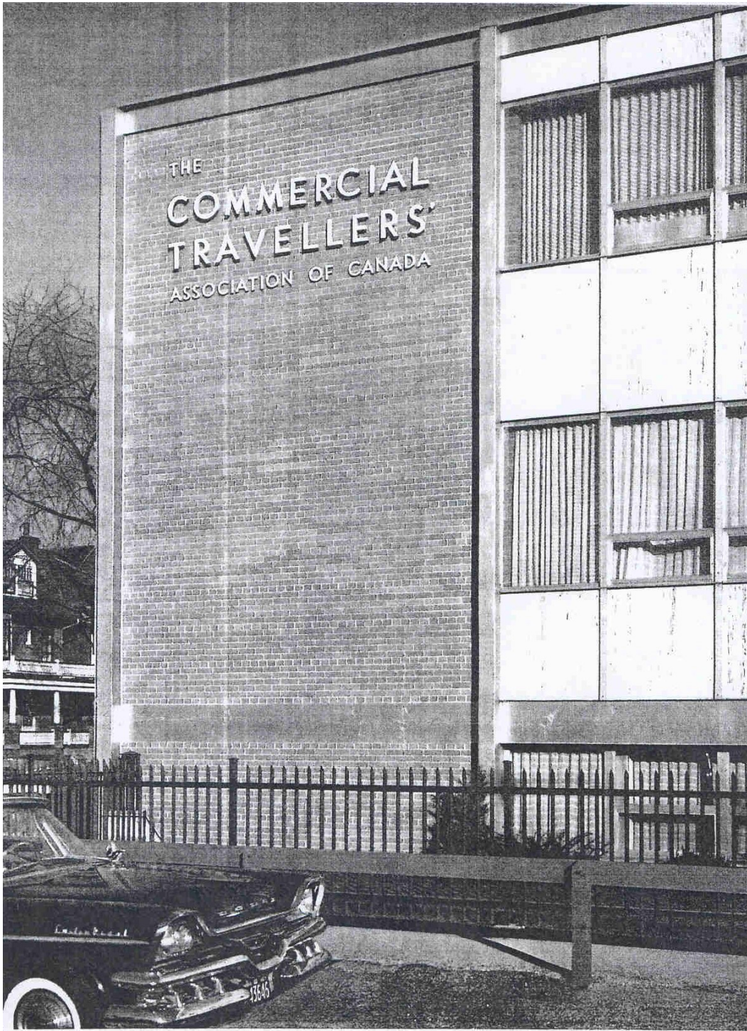
Cripps & Assocs., Archts.