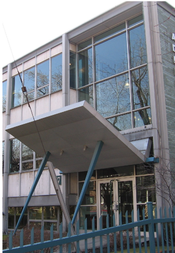
Detailed view of the north entrance bay, March 2010