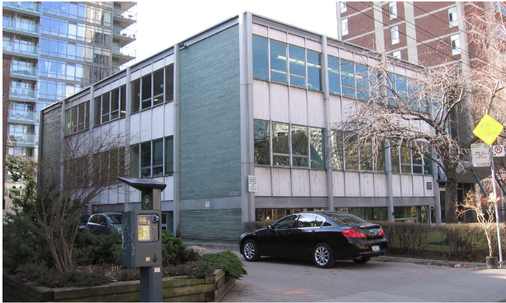
View of the principal (north) façade (right) and the east elevation (left)