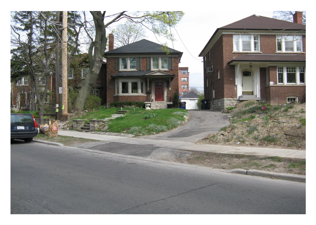
274 Chaplin Crescent – April 16, 2010