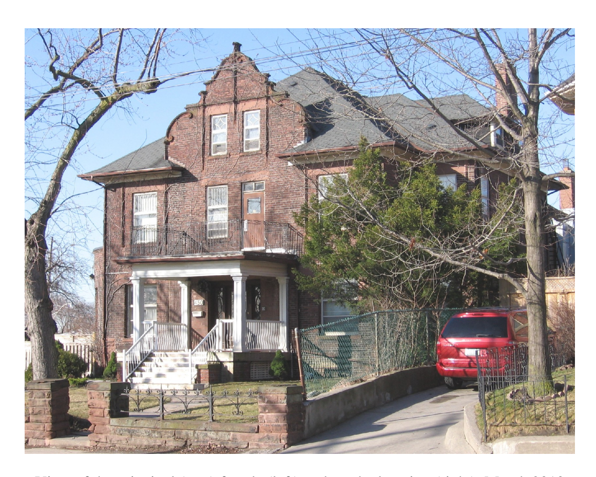
View of the principal (east) façade (left) and north elevation (right), March 2010