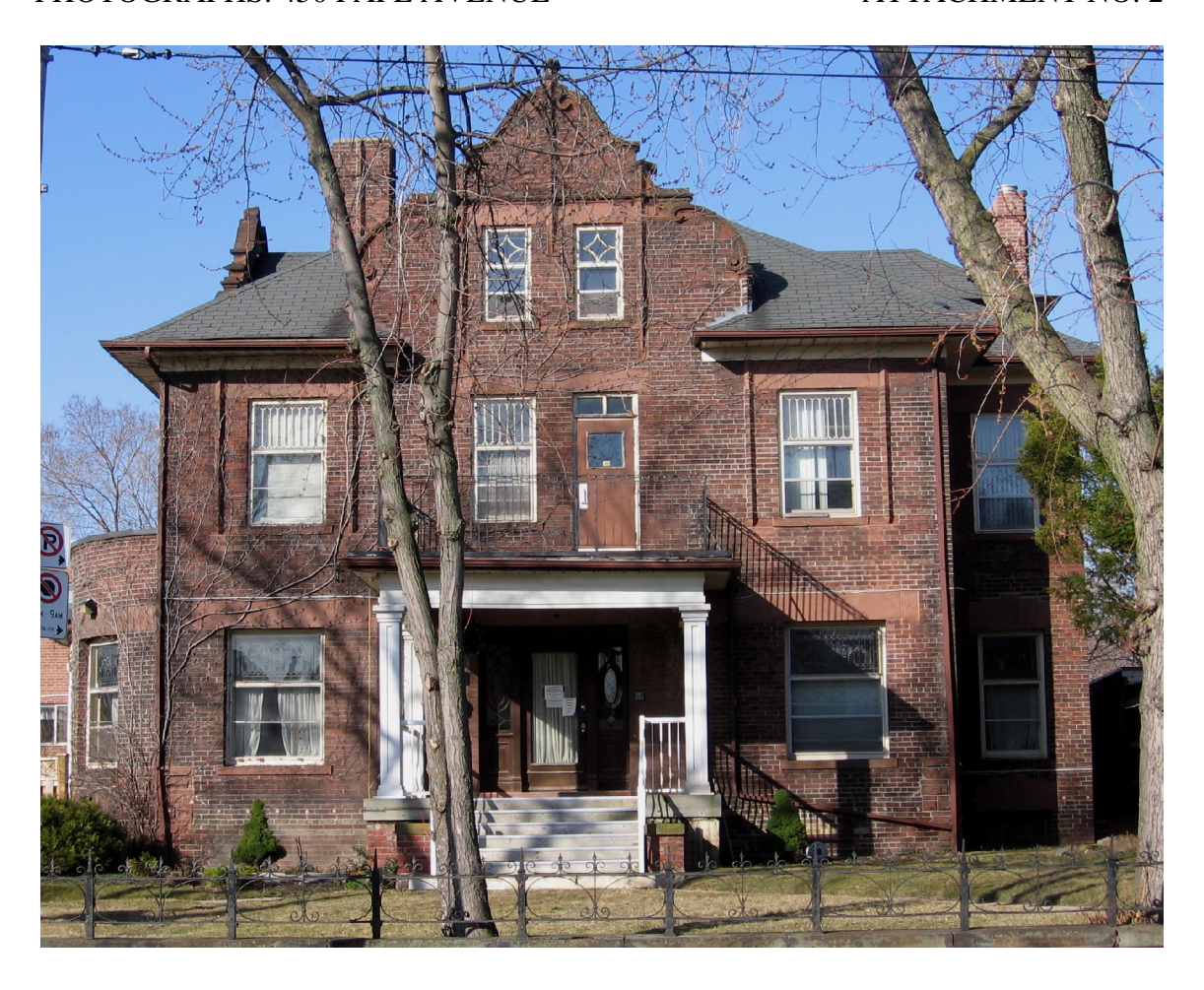
Principal (east) façade