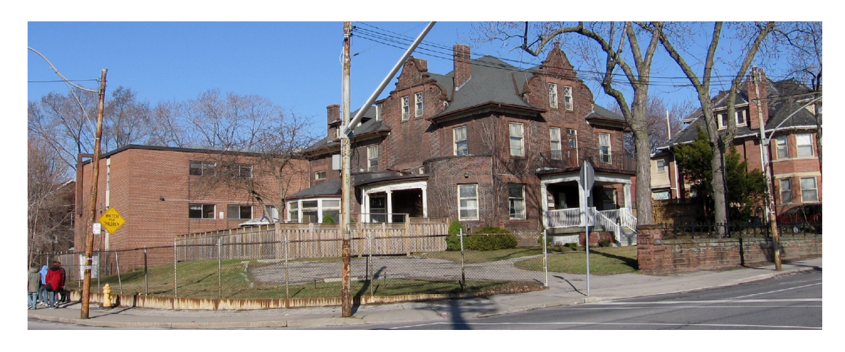
Contextual view, showing the property at the northwest corner of Pape Avenue (right) and Riverdale Avenue (left)