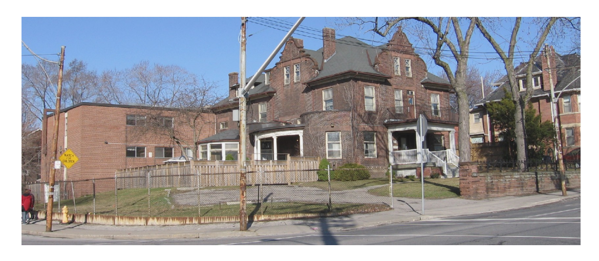
View of the principal (east) façade facing Pape Avenue (right) and the south elevation overlooking Riverdale Avenue (left)