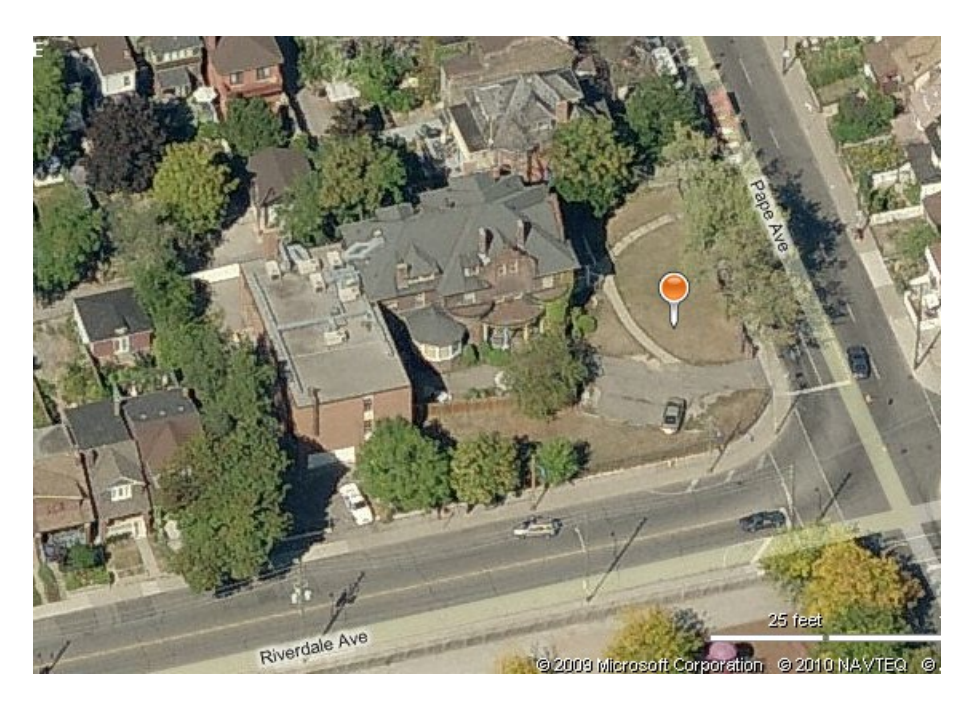
Aerial view, showing the size of the property in relation to the adjoining sites, as well as the circular drive off Pape Avenue