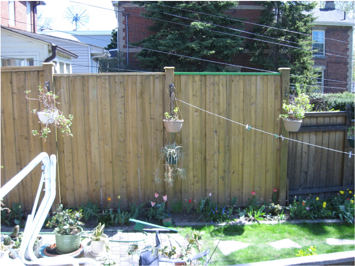
Attachment 2, Photograph of Fence in Rear Yard Facing East