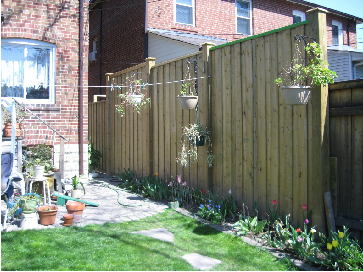
Attachment 3, Photograph of Fence in Rear Yard Facing North