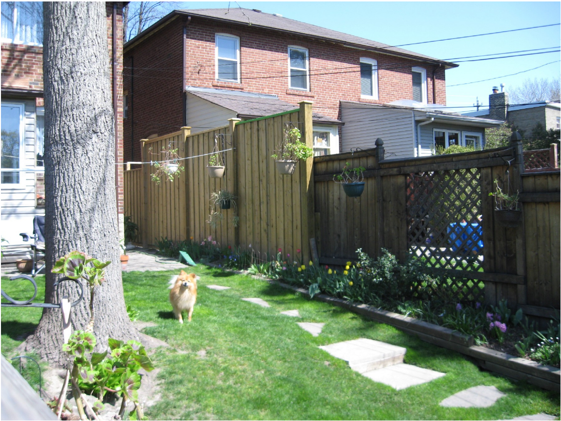
Attachment 4, Photograph of Fence in Rear Yard Facing North