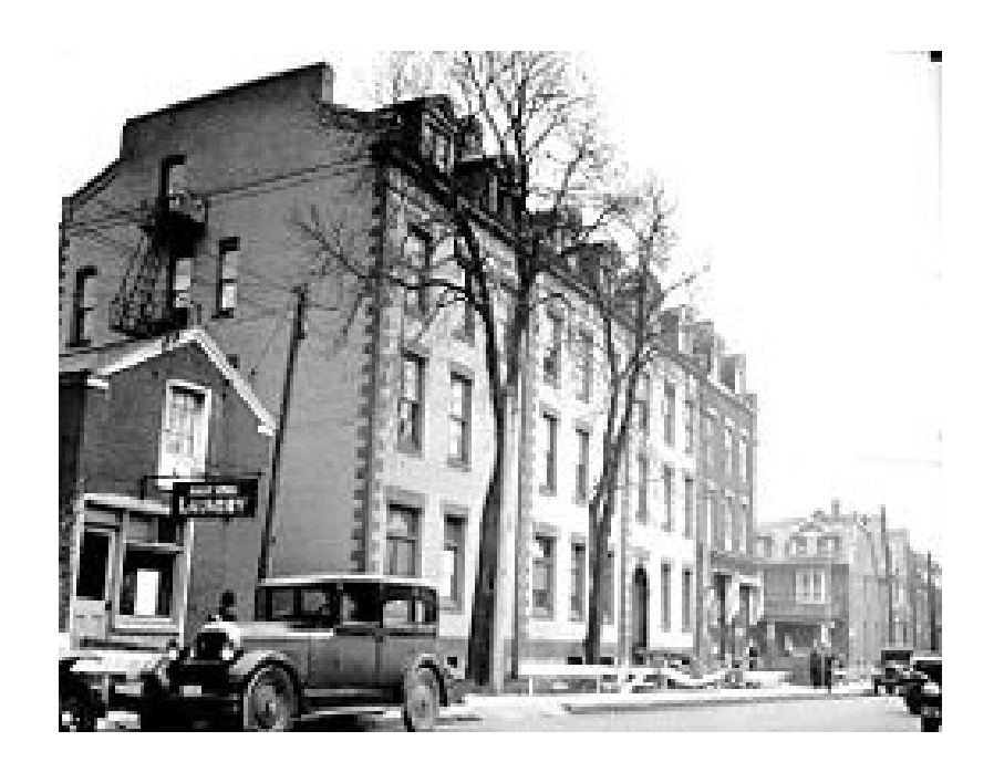
Archival Photograph, showing Walnut Hall in 1934