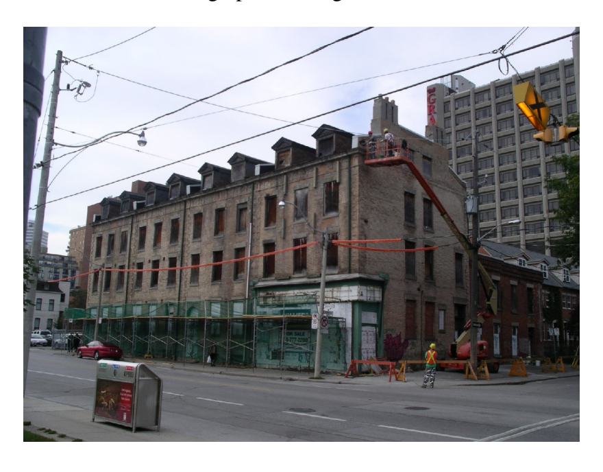
Photograph of Walnut Hall prior to its partial collapse and demolition (Heritage Preservation Services, 2006)