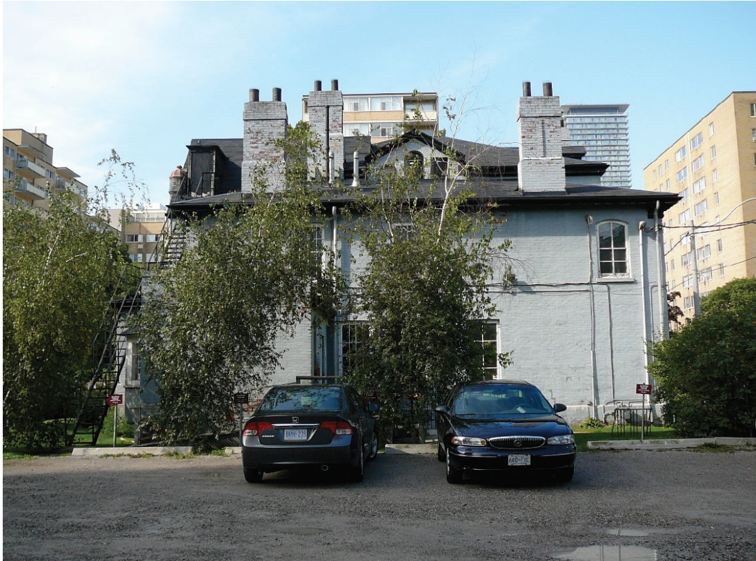
Alteration of a Heritage Property – 571 Jarvis Street / 119 Isabella Street (Casey House Hospice)