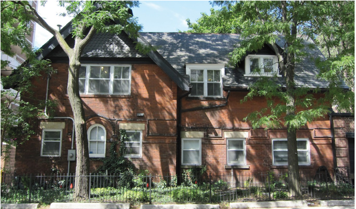
Alteration of a Heritage Property – 571 Jarvis Street / 119 Isabella Street (Casey House Hospice)