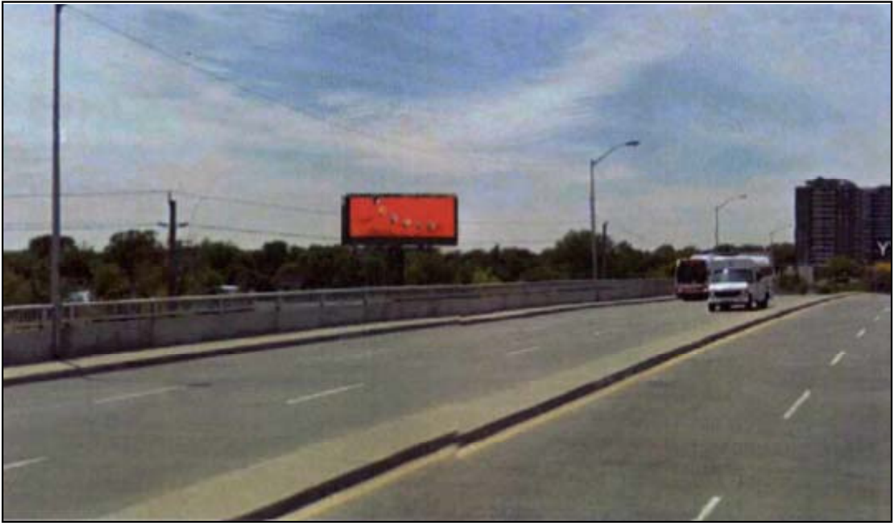
5. Looking west - F.G. Gardiner Expressway; 100 metres east of Atlantic Avenue; north side; facing east