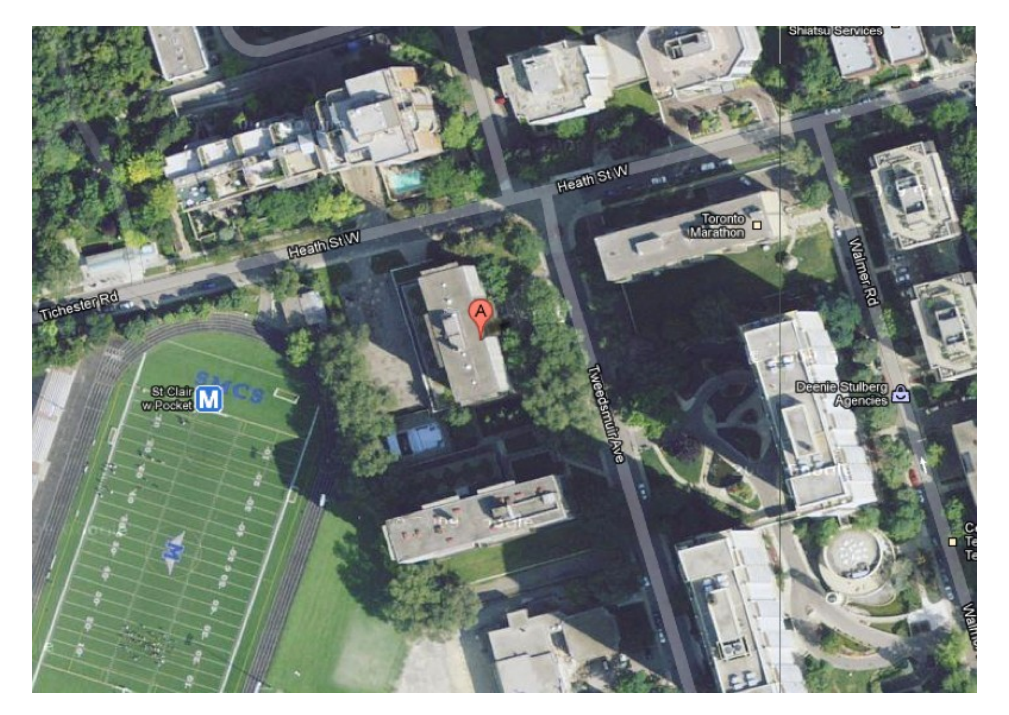
Staff report for action – 310 and 320 Tweedsmuir Ave - Public Art Plan

The project is phased, with the first phase (north tower) site currently being excavated. The second phase will commence in accordance with market conditions.