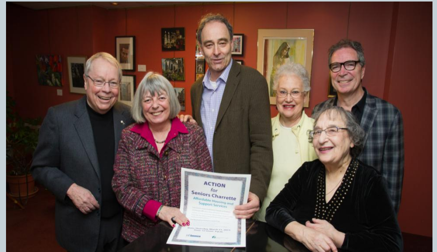
Charette, Performing Arts Lodge, March 2013