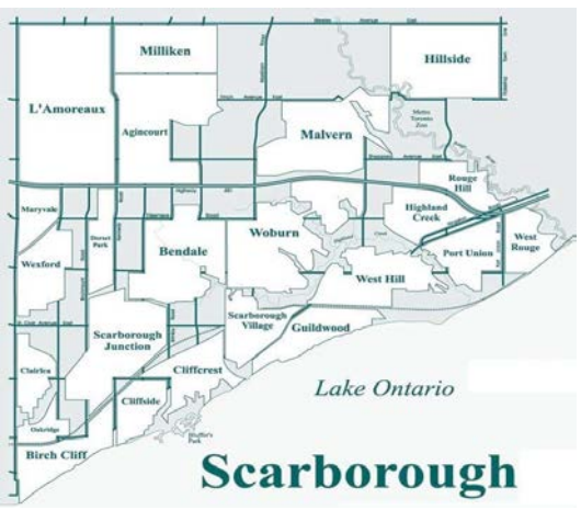
Figure 1: Toronto East Quadrant LIP area

The overall objective of the TEQ LIP initiative is to enhance the capacity of service providers to more effectively meet the current and emerging needs of newcomers in Scarborough by supporting an integrated and collaborative approach to effective service delivery.