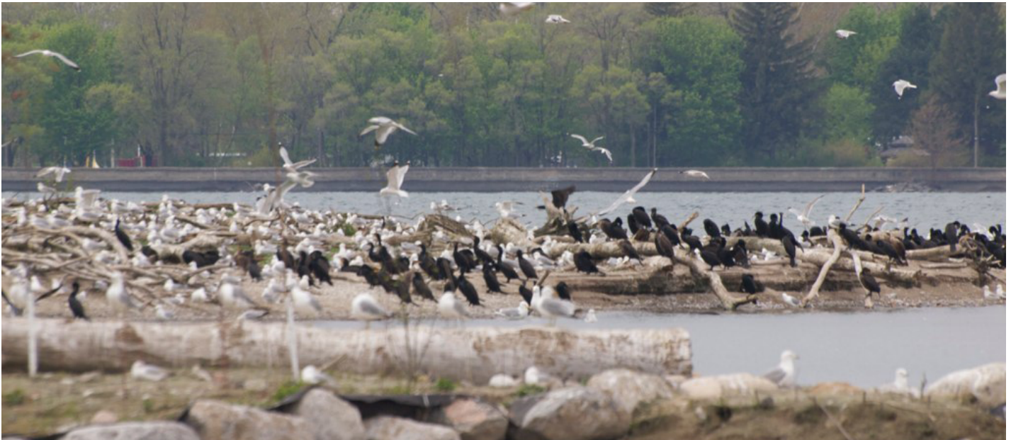
Birds at Tommy Thompson Park

and may decrease wave heights in the Western Gap. 26 As well, expansion-related construction may mobilize the silt and clay surrounding the eastern end of the runway but the use of a silt curtain could potentially mitigate this effect. 27