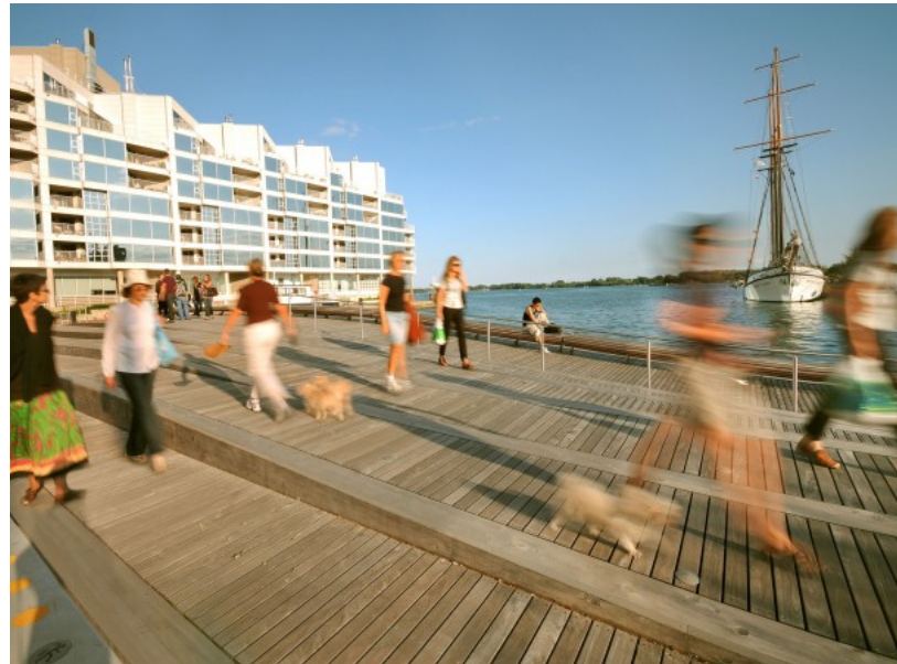
Toronto's Active Waterfront (Waterfront Toronto)

The waterfront's current vibrancy and beauty are the result of careful planning that transformed the post-industrial waterfront into one of Toronto's most enjoyable areas. On-going planning and development initiatives like the ones mentioned above will unlock even more of the area's potential and achieve one of the largest waterfront renewal projects in the world. Any changes to the Airport must support this continued waterfront renaissance.