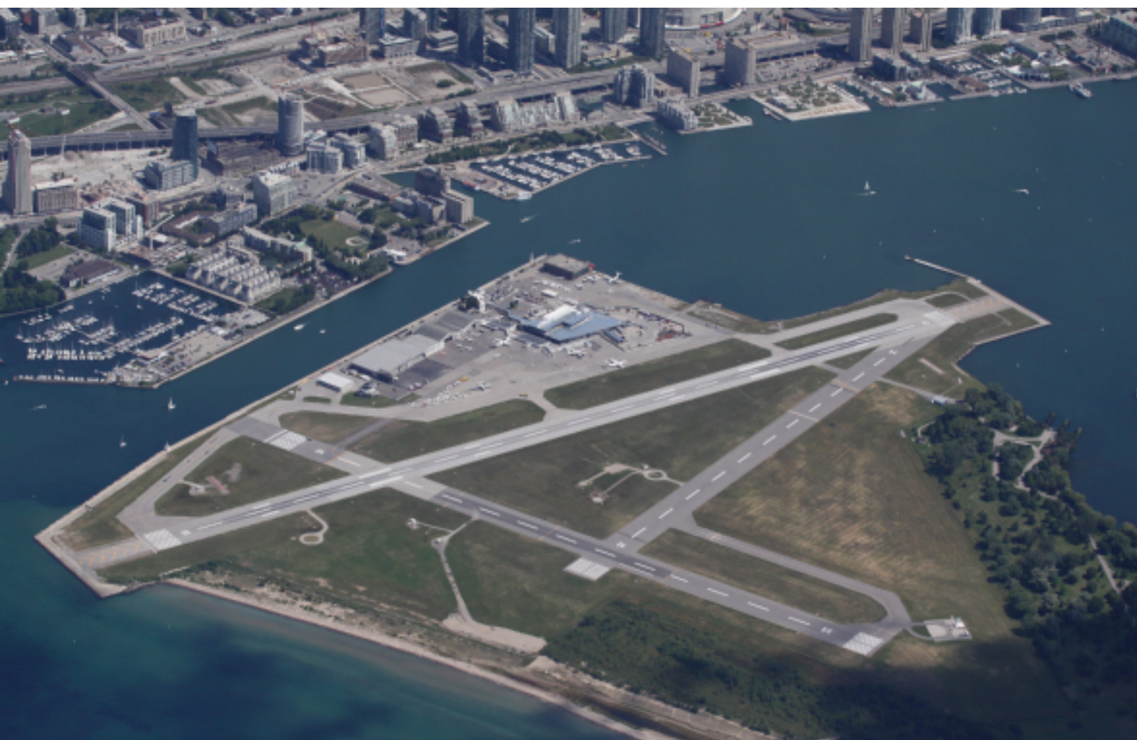
Aerial View of Billy Bishop Toronto City Airport (Flickr - vitodens)