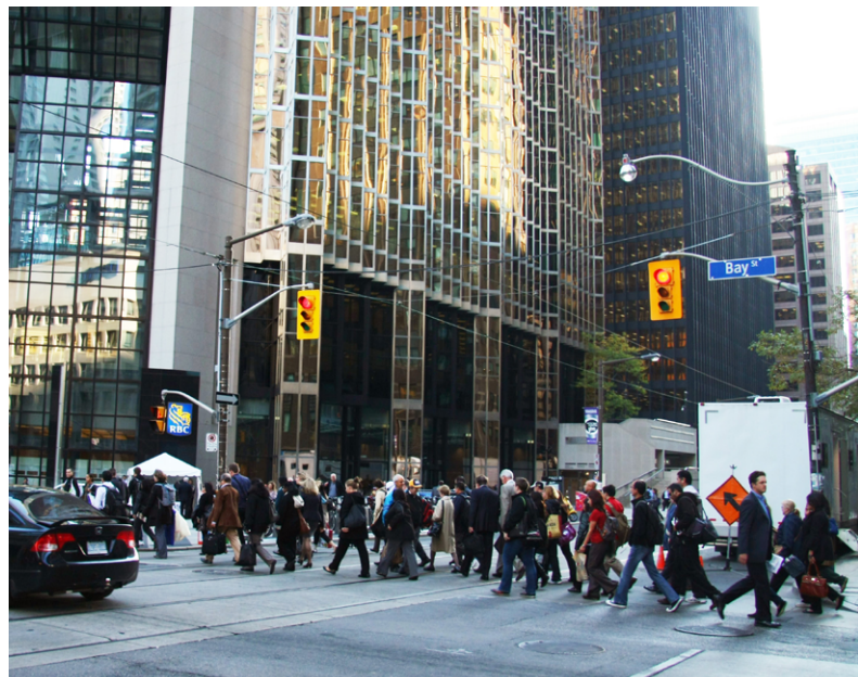
Toronto's Financial District – Bay Street & Wellington Street West

At this point, the assessment of the Airport's potential economic benefits with jets has not taken into account the cost of the Airport's expansion (estimated at approximately $80 million 23 ) or the associated costs of upgrading the transportation network on the mainland (estimated to range from roughly $1 million to more than $125 million depending on the level of infrastructure changes, keeping in mind the standard of public realm improvements on the waterfront 24 ). The Review has also not considered the potential incremental economic impact of expanding airport operations beyond the existing 202 daily movement cap with or without jets. Potential negative impacts could include loss of tourism revenues due to increased Airport operation in the waterfront, economic costs associated with accommodating more passengers on the road, and transit network or costs resulting from potential health impacts.