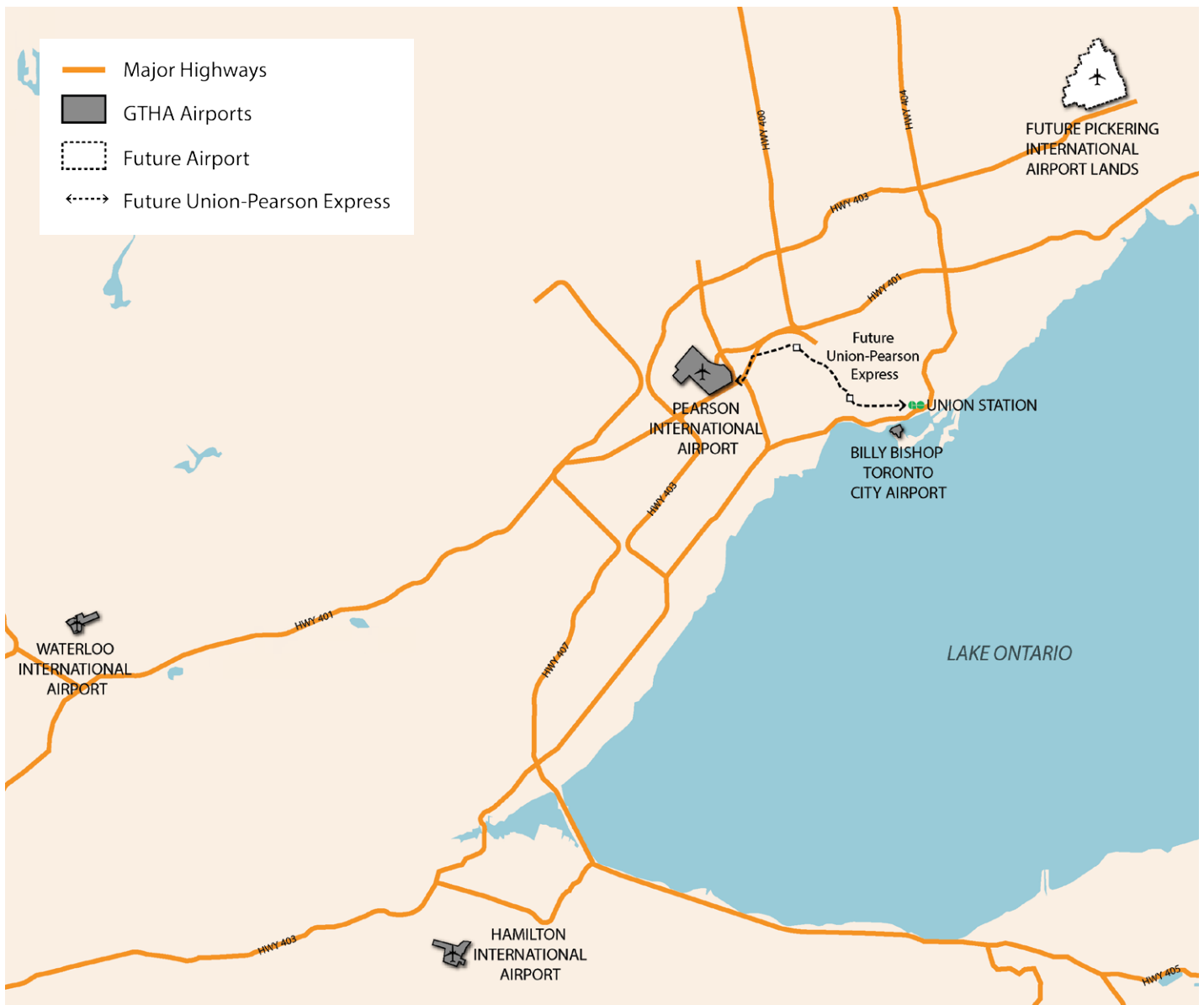
Existing and Planned International Airports in the Greater Toronto and Hamilton Area