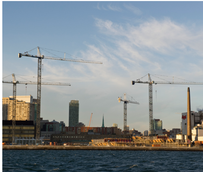
Development on Toronto’s Waterfront

The harbour has evolved from its previous use as an industrial waterfront but commercial boat operations continue in the Inner Harbour alongside a range of