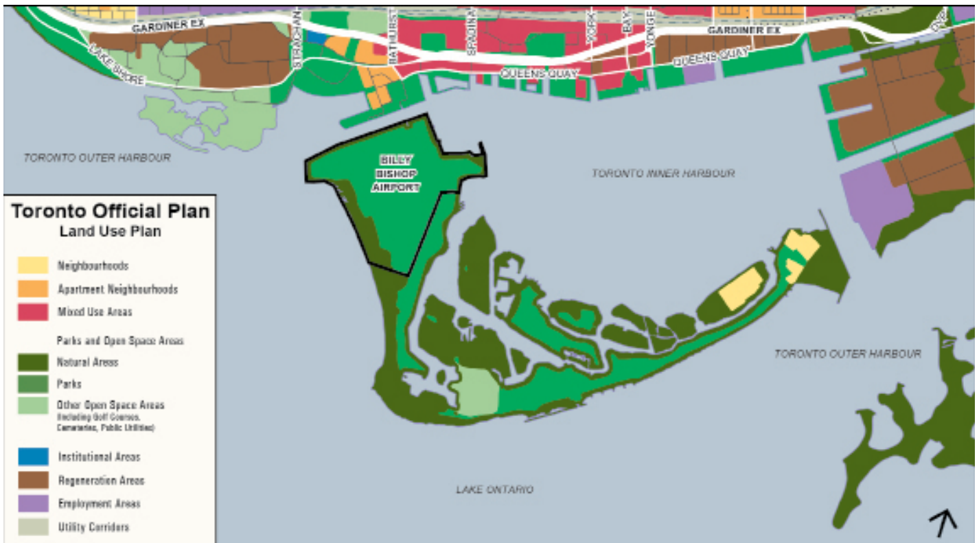
City of Toronto Official Plan – Land Use Plan