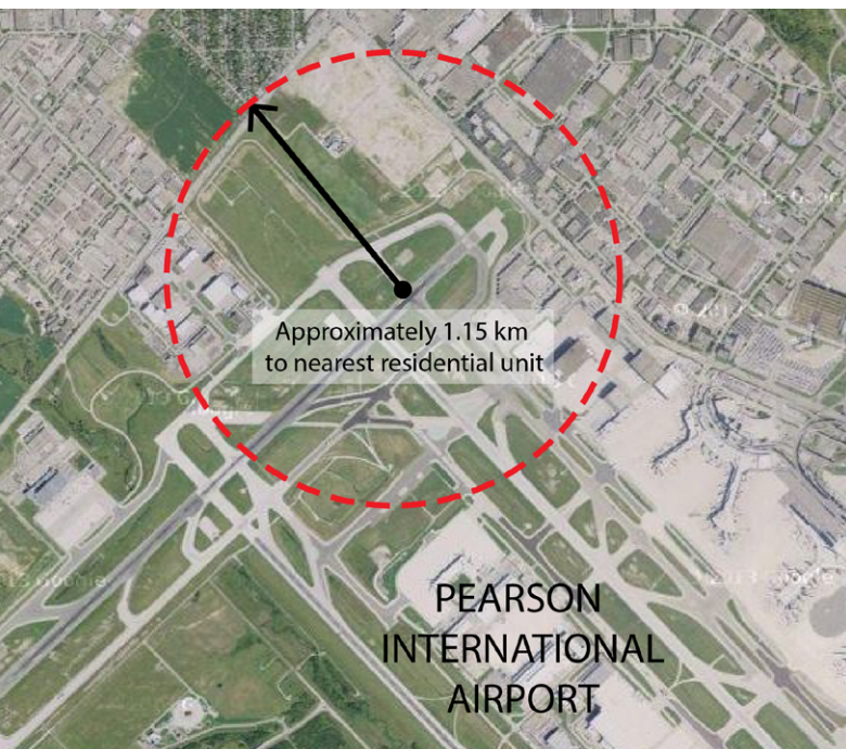
Distance from a Runway to the Nearest Residential Building at Pearson International Airport