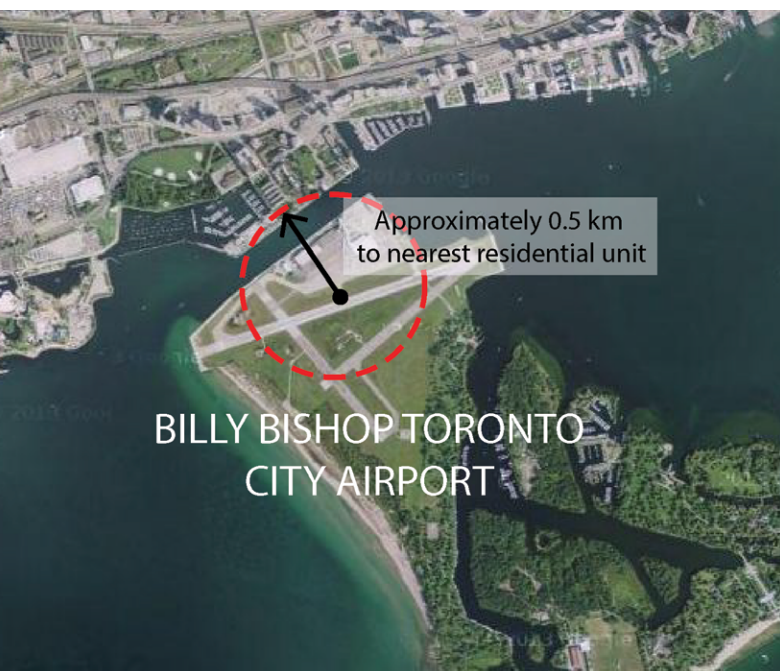
Distance from a Runway to the Nearest Residential Building at Billy Bishop Toronto City Airport