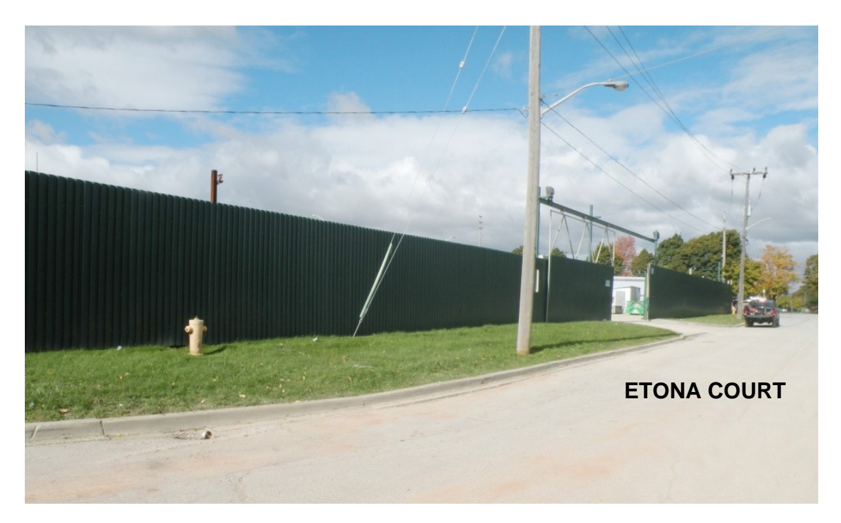
View from Etona Court flankage