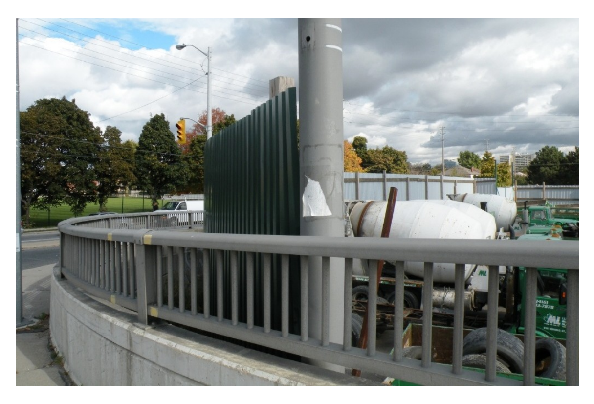
View from Islington Avenue showing the end of fence at Judson frontage