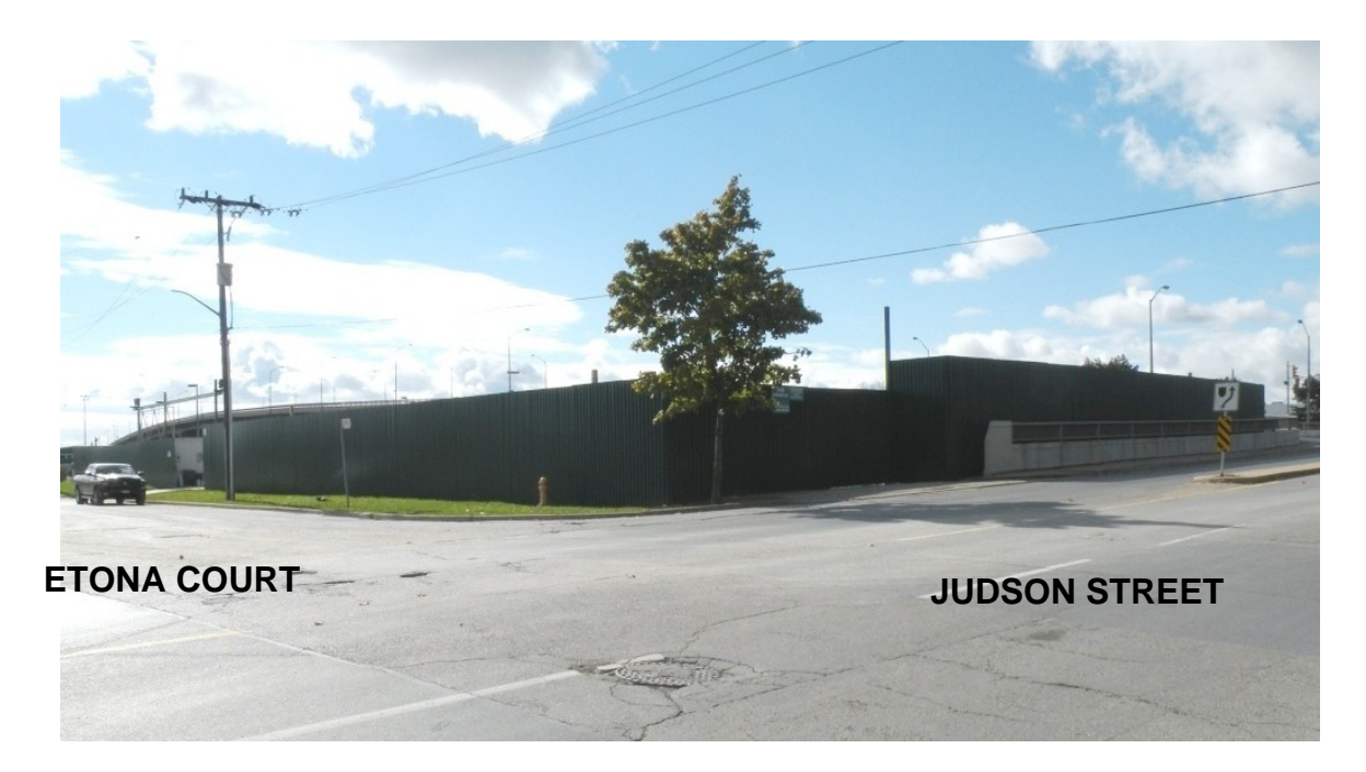
View from Judson Street frontage and Etona Court flankage