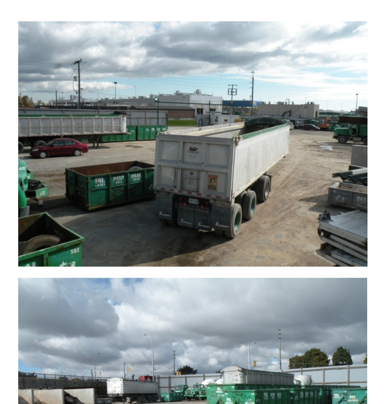
Attachment 5: Photographs showing the site condition within the fenced area