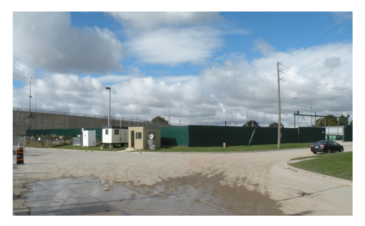
View from private street at rear and Etona Court flankage