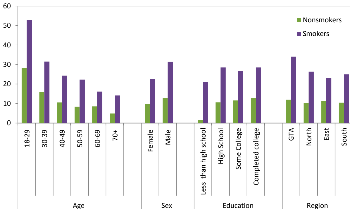
Figure 1: Prevalence of Past 30-day Exposure to Smoking on a Patio among Smokers and Nonsmokers by Age, Sex, Education, and Region in the Ontario Tobacco Survey (Baseline Interviews), 2006-2008, n=4997

on a patio, but 21% of smokers with less than high school education had been exposed on a patio in the past month.