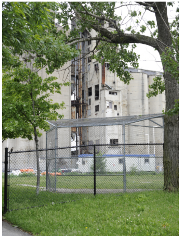
A Small Park Leased by the Waterfront School on Eireann Quay is Surrounded by Fencing