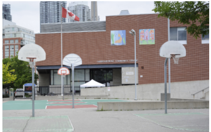
Harbourfront Community Centre Basketball Courts