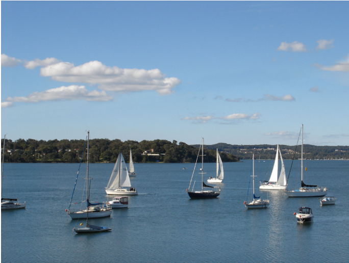
Recreational Boaters in the Inner Harbour