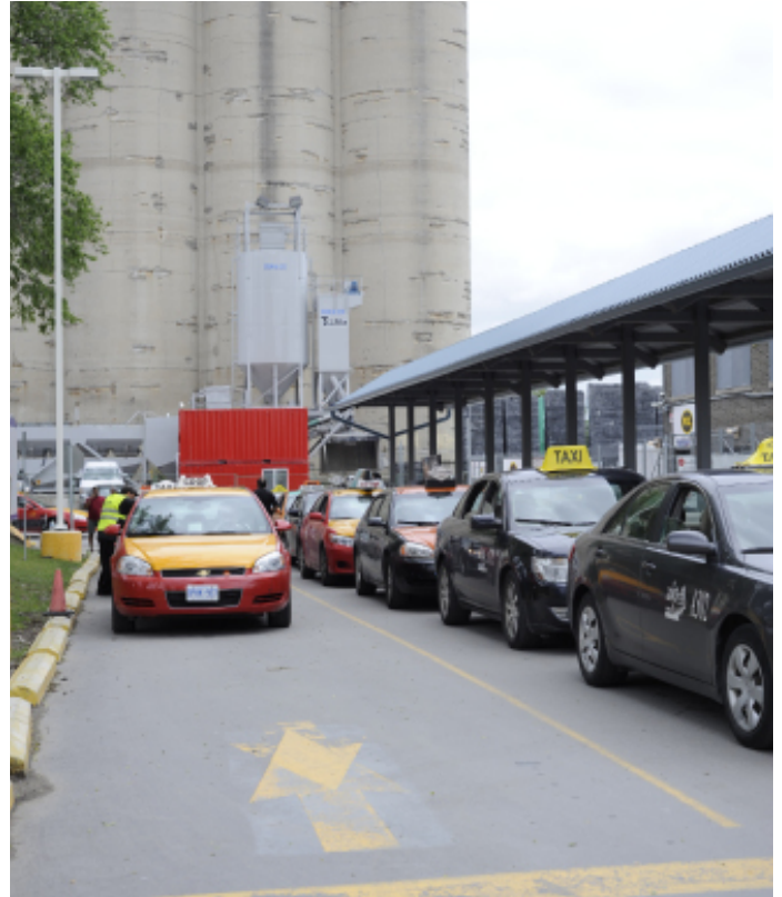
Temporary Taxi Queuing Facility on the Canada Malting Site

If that mode switch cannot be achieved – and it will be very challenging given the current dominance of cars and taxis as mode choices to and from the Airport – then the increase in traffic associated with jets would need to be resolved through a series of road network improvements including a reconstructed westbound left turning lane at Dan Leckie Way and Lake Shore Boulevard and a restricted westbound left turn at the Bathurst Street / Lake Shore Boulevard intersection. 44