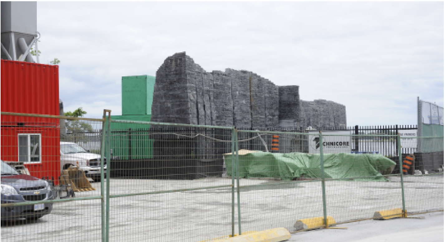
Little Ireland Park and Temporary Construction Barriers