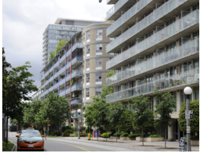
Looking West on Queens Quay West from Eireann Quay

Given the challenges under existing conditions, there is an immediate need to better integrate Airport-related facilities, enhance access to and continuity of waterfront trails along Portland Slip and the Western Gap, and improve the environment of important Bathurst Quay community assets. It may be possible for the Canada Malting site to be redeveloped for adaptive re-use – in keeping with the Central Waterfront Secondary Plan vision – and that new development could provide acceptable longer term solutions to parking, taxi storage and drop-off. Ideally, facilities for parking, taxis or transit could be