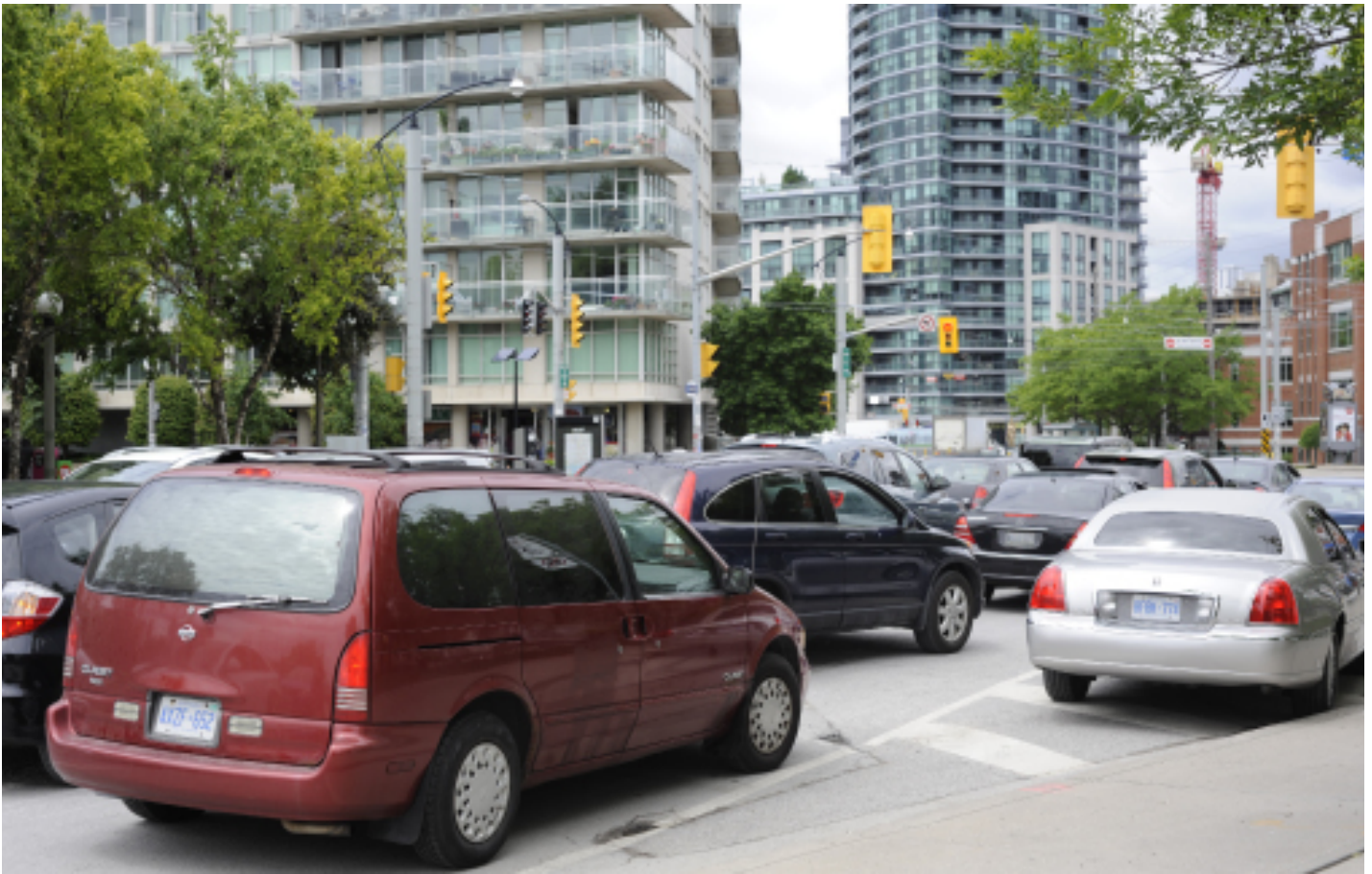
Traffic at Eireann Quay and Queens Quay West