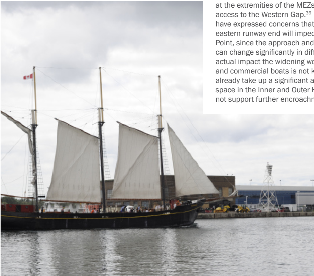
The Schooner Kajama in the Western Gap

The proposed expansion would have some impact on boating in the Inner and Outer Harbours. The Tripartite Agreement does not permit any changes to the Marine Exclusion Zones (MEZ) that would materially encroach on the Western Gap. Still, the proposed 200 metre runway extensions for Runways 08 and 26 do include widening the MEZs but only in the areas closest to the runway ends and not at the points that extend furthest into the Inner Harbour and Lake Ontario. 34 The proposed changes include a 25.2 metre widening of the eastern MEZ at its southwestern corner and 11.6 metre and 12.1 metre widenings of the western MEZ at its northeastern and southeastern corners respectively. 35 It is Porter Airline's position that by leaving the buoys in place at the extremities of the MEZs, the proposal does not affect access to the Western Gap. 36 However, Ferry boat operators have expressed concerns that the widened MEZ on the eastern runway end will impede the ferry route to Hanlan's Point, since the approach and departure routes for the ferries can change significantly in different weather conditions. The actual impact the widening would have on other recreational and commercial boats is not known at this time but the MEZs already take up a significant amount of navigable water space in the Inner and Outer Harbours and the City should not support further encroachments.