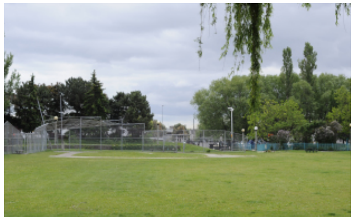
Little Norway Park

accommodated below grade, leaving the street level for retail uses and public realm improvements. This possibility should be explored with a focus on providing mutual benefits to the neighbourhood and the Airport.