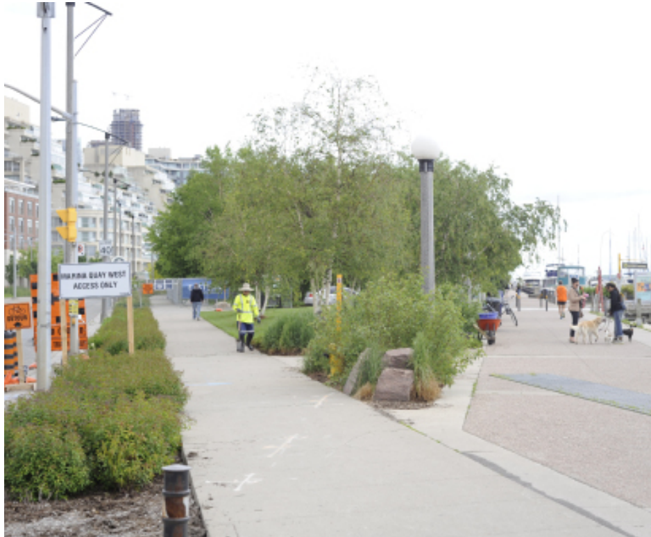
An Extension of Dan Leckie Way would Create Unacceptable Impacts on the Portland Slip Promenade (left) and the Toronto Music Garden (right)