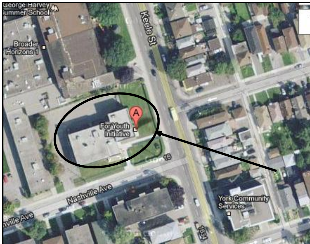
Appendix B - Amendment to Below-Market Rent Lease Agreement with FYI at 1652 Keele St