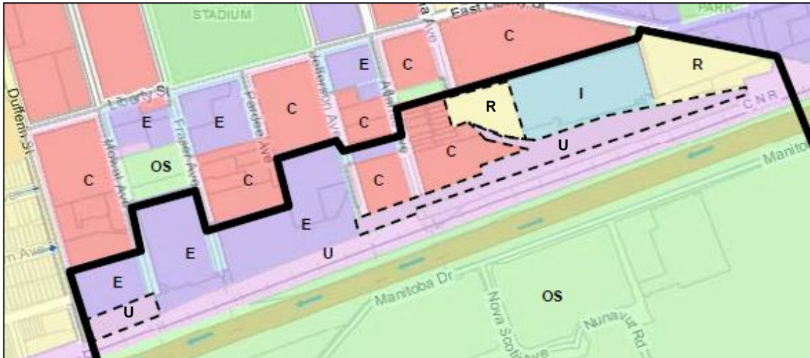
Figure 3 – Properties inside the GG-SSD proposed to be Re-Designated

These locations include a series of properties that are directly north of the rail corridor which are proposed to be re-designated as 'U', as well as a formerly vacant property at the base of Hanna Avenue that has been redeveloped into a large condominium building proposed to be re-designated as 'R'. See properties outlined in Figure 3 below.