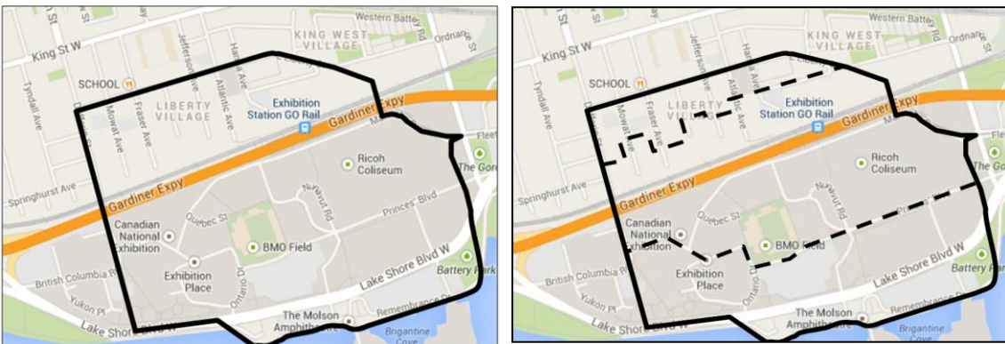
Figure 2: Current Boundaries of GG-SSD (left) and Proposed Boundaries for GG-SSD (right)

The properties which would be excluded from the GG-SSD are proposed to be re-designated as OS-Open Space, E-Employment and C-Commercial in keeping with current land uses in the area and the future plans for Ontario Place. Although the properties to be re-designated as C-Commercial and E-Employment will still have the ability to display third-party signs, the signs could not display electronic static sign copy. As well, third party signs will no longer be permitted along the lake shore, as they are not a permitted sign class in OS-Open Space sign districts (see Figure 4 below).