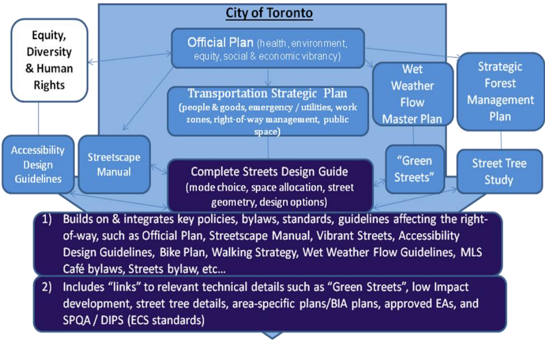
Figure 1 – Policy Integration Framework

Transportation Association of Canada, AODA, Highway Traffic Act, Metrolinx plan