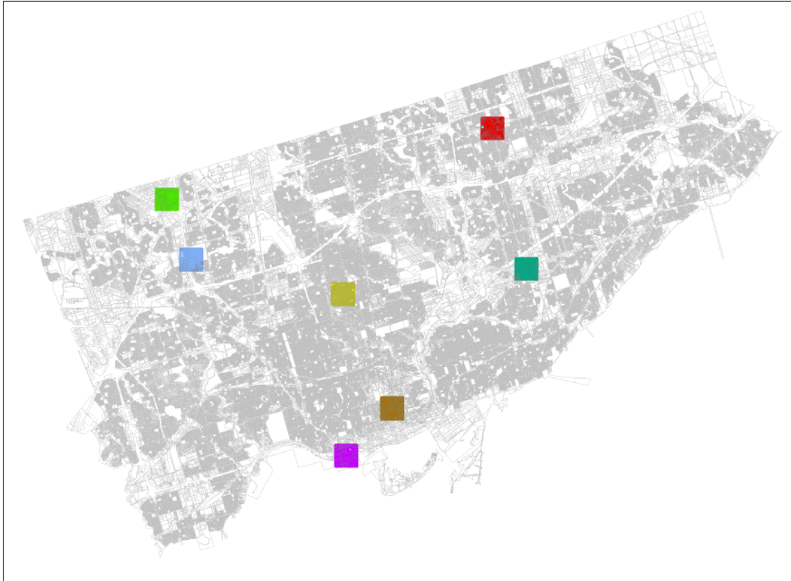
Figure B1 – Areas used for preliminary analysis of a potential stormwater charge.