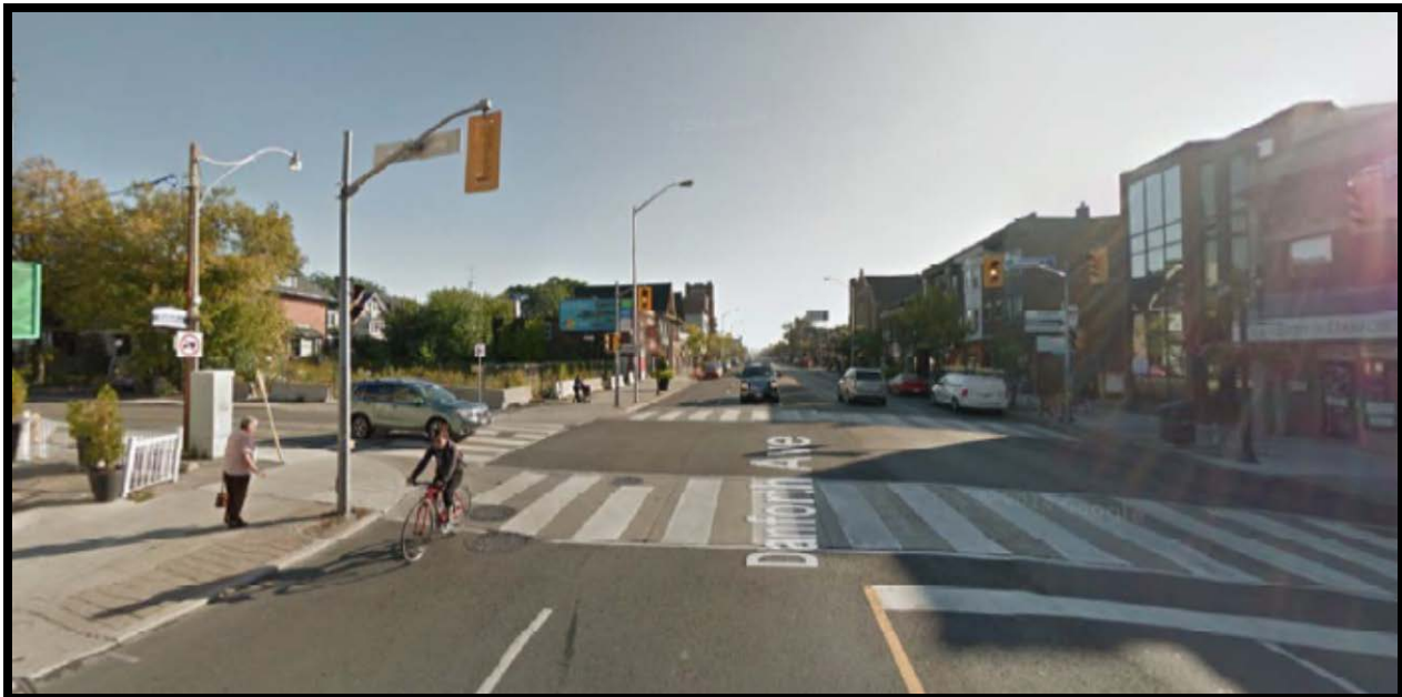
View East – Danforth Avenue