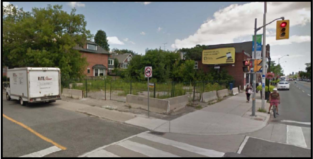
242 Danforth Avenue, Toronto