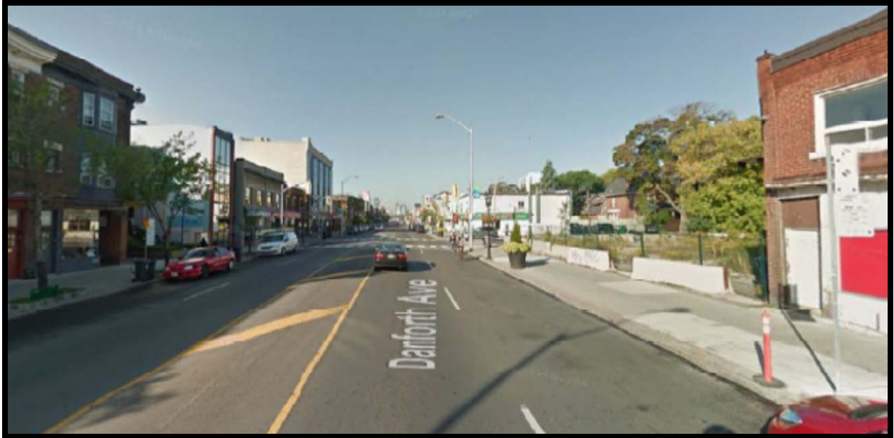
View West – Danforth Avenue