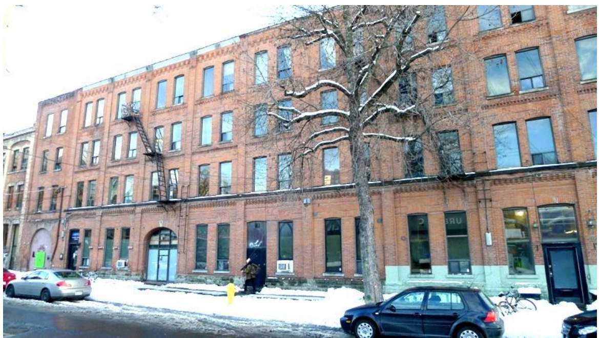
Showing the principal (north) façade of 101-107 Niagara Street, 1887 as illustrated in 1897 with the edge of 109 Niagara Street at the right (top Toronto Board of Trade , 1897) and as photographed in 2014 ( Heritage Preservation Services )

Intention to Designate and HEA Authority - 89 -109 Niagara Street