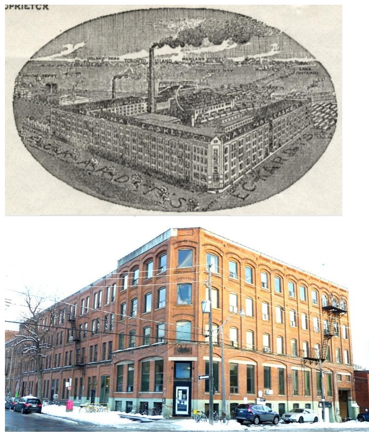
Showing a view of 89-109 Niagara Street, 1883-87, as it appeared on Eckardt's National Casket Company letterhead in 1908 (above, Toronto Public Library, 1908 ) Showing the principal (north and east) façades of 109 Niagara Street, 1887, 101-107 Niagara Street, 1887, to the left, with 95-97 Niagara Street, 1886 to the far left as in 2014 (bottom, Heritage Preservation Services )

Intention to Designate and HEA Authority – 89 -109 Niagara Street