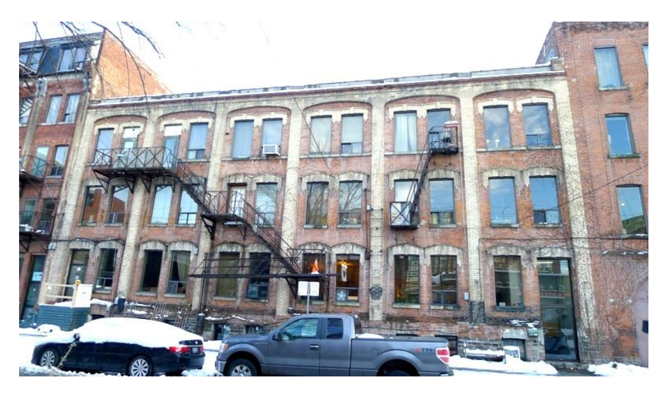
Showing the principal (north) façade of 95-97 Niagara Street,1886 (Heritage Preservation Services, 2014)