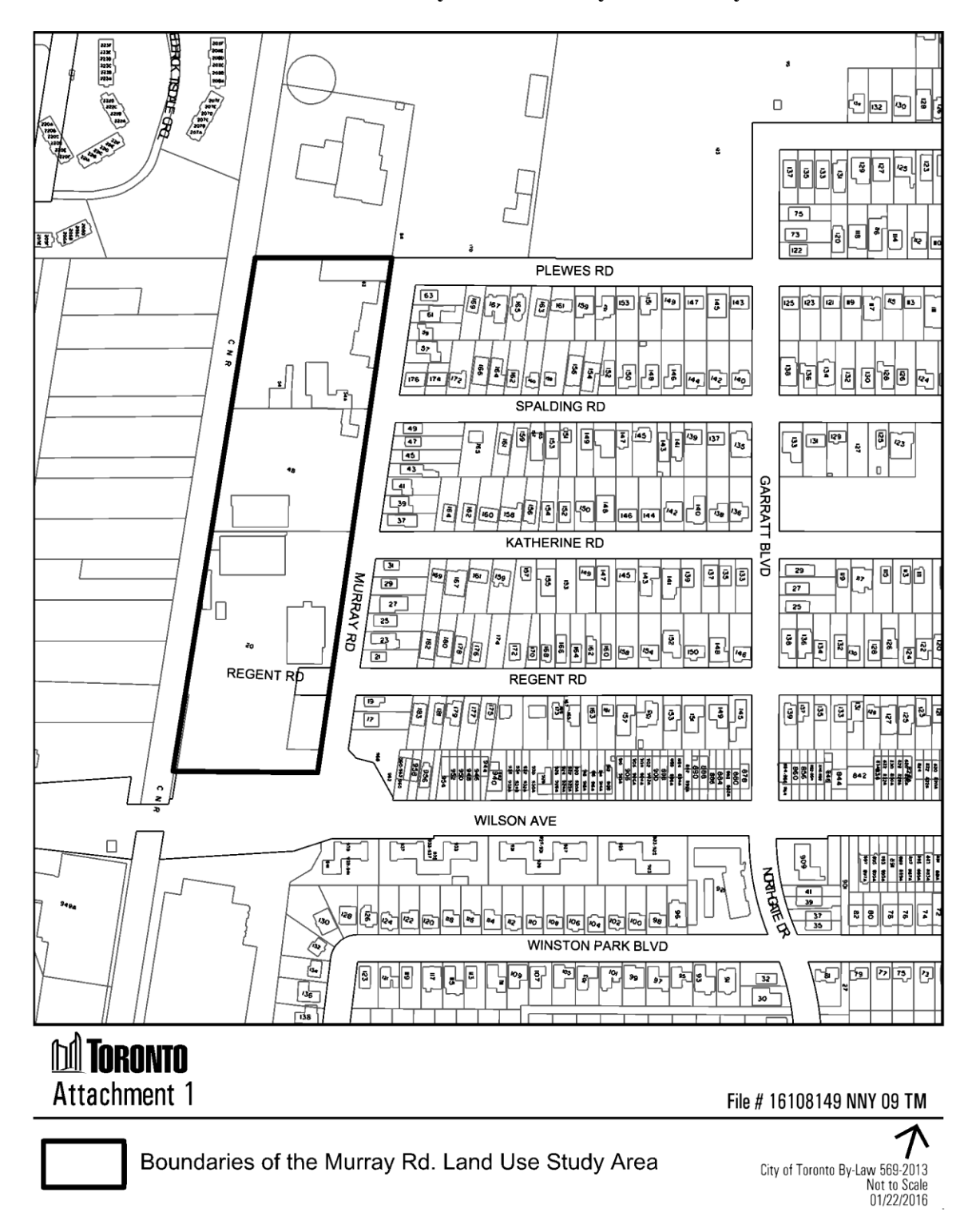
Attachment 1: Boundary of the Murray Road Study Area