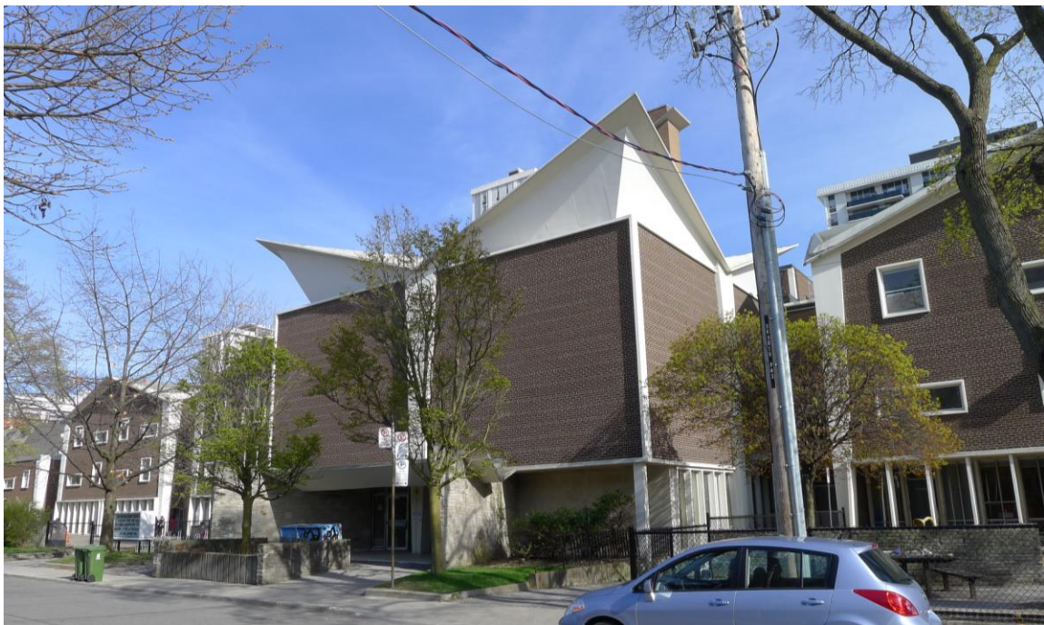
Photographs showing an aerial view of the school complex with the entry pavilion at the centre, two Toronto School for the Deaf pavilions to the left with the 1965-6 addition at the far left and the Davisville Junior Public School and Day Nursery on the right (top photo- Google Maps April, 2016 ) and the north elevation facing Millwood Road with the entry pavilion flanked by the junior school on the right and the Deaf School on the left (bottom photo - Heritage Preservation Services (HPS) 2016)