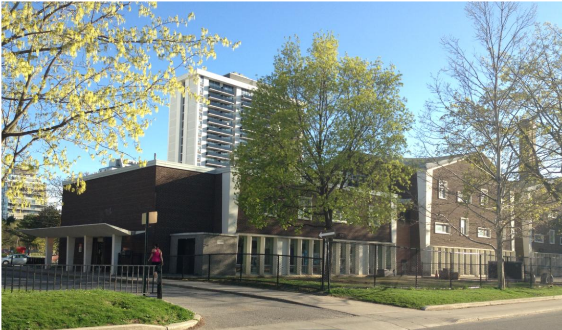
Top photograph showing the south elevation of the school facing the playground with the Day Nursery and Roof-top Playground on the left, the Junior School and shared services pavilion with chimney and the School for the Deaf with 1965-6 addition at the far right. (HPS, 2016) Bottom photograph showing the east and north elevations of the two-storey, 1965-6 addition (HPS, 2016)