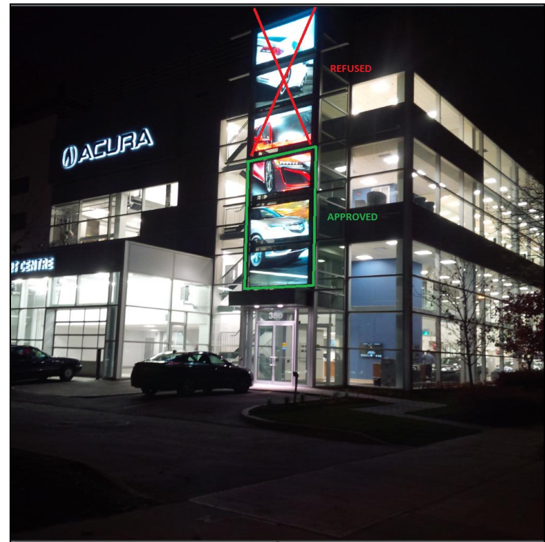
Figure 3: Approved Signage Master Plan