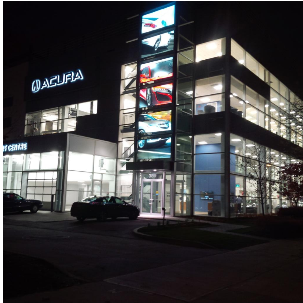
Figure 2: Alternative Signage Master Plan