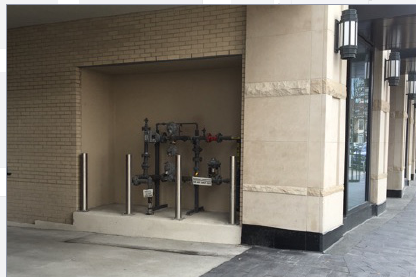
>> good example