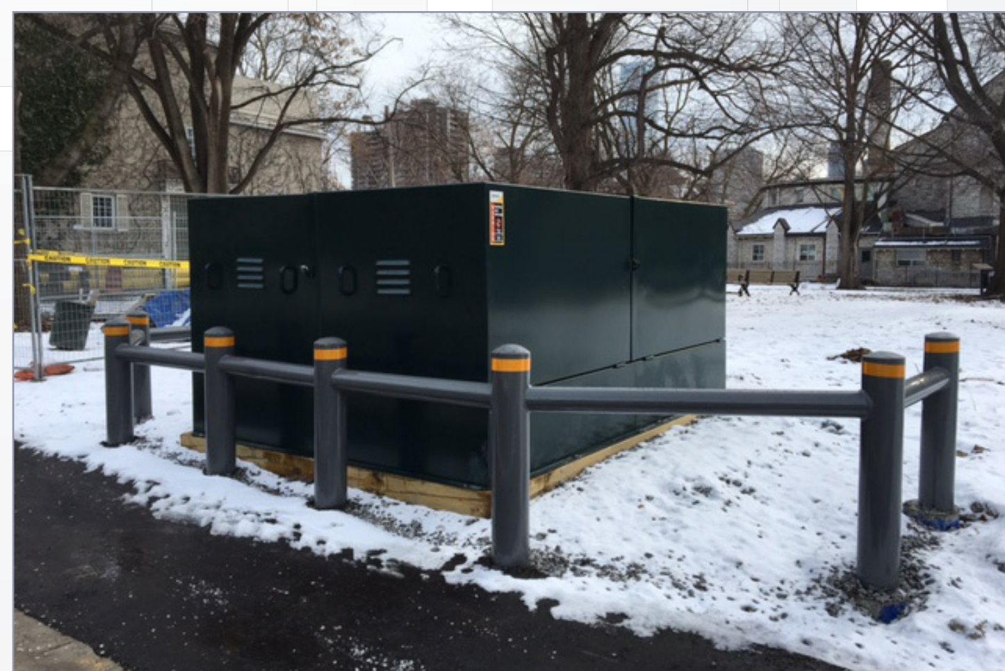
>> mcpherson green > after