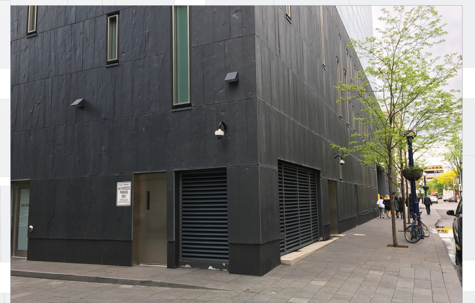
>> good example