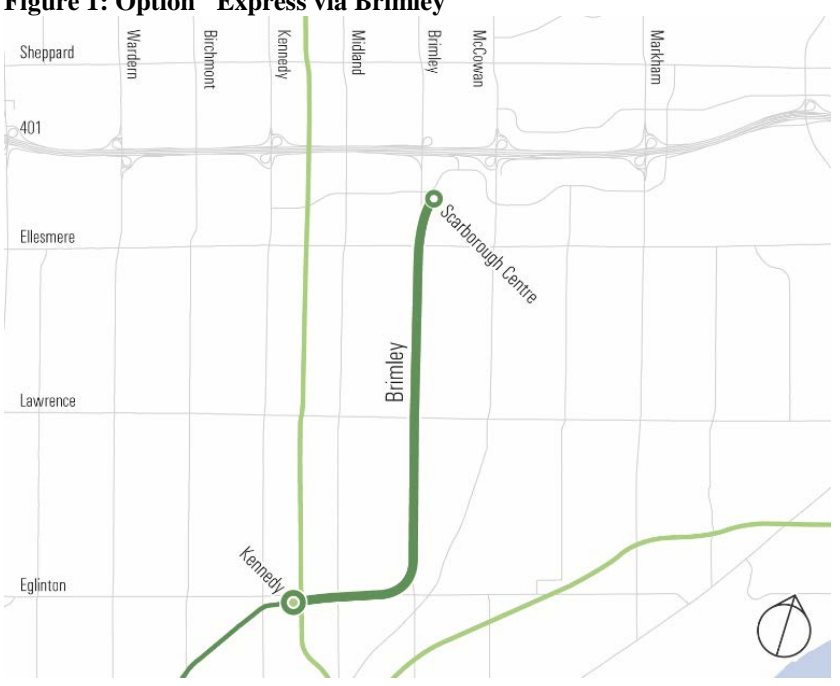
Figure 1: Option "Express via Brimley"

Through this process of developing options to reduce the capital cost of the SSE, an option emerged that considered an express extension via Brimley Road. Prior to the emergence of the express option, the Brimley corridor option had been removed from consideration as part of the '3-stop' scenario in June, 2015, as it did not perform as well as other '3-stop' alignments that were being considered at the time (Midland, McCowan and Bellamy)<sup>1</sup>. The Brimley option (Figure 1) reemerged for consideration as a potential express alignment as it could reduce the capital costs while maintaining the operation of the SRT during subway construction.