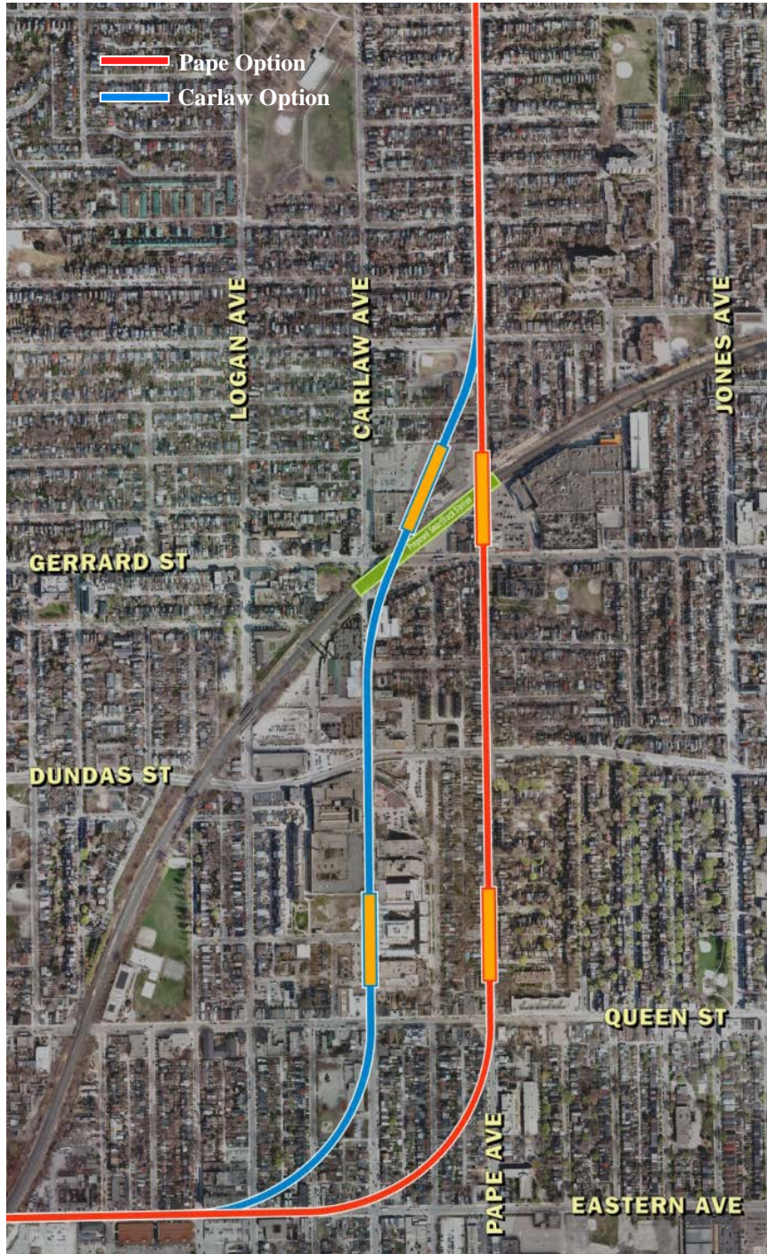
Figure 2: Local Segment Alignment Options

Note: Work is underway with Metrolinx to plan for an optimal connection between the Relief Line station and the SmartTrack station at Gerrard.