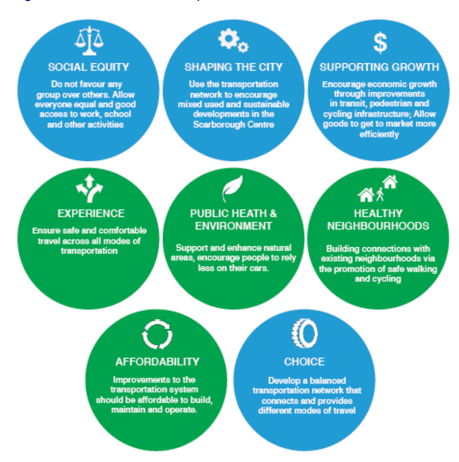
Figure 2: Evaluation Principles

In Phase 2 of the study, a number of criteria and specific measures will be developed for each principle to evaluate the alternatives.