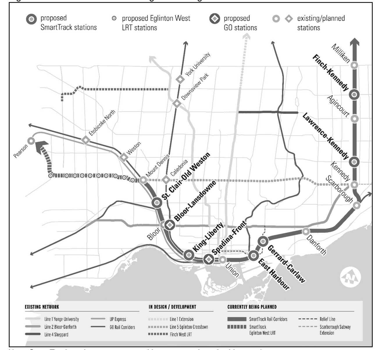
Figure 1. SmartTrack Stations Program and Eglinton West LRT Extension

the Metrolinx Business Case Methodology. The City's Rapid Transit Evaluation Framework (RTEF) was also integrated into the analysis. The IBCs for both the SmartTrack Stations Program and the Eglinton West LRT extension identified options that demonstrated strategic benefits and positive benefit-cost ratios.