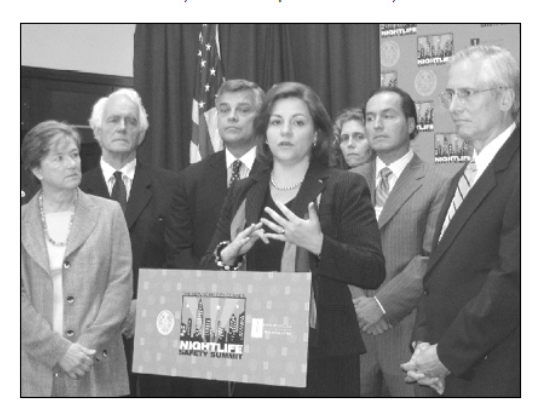
Villager photo by Lawrence Lerner

Volume 76, Number 20 | October 4 - 10, 2006