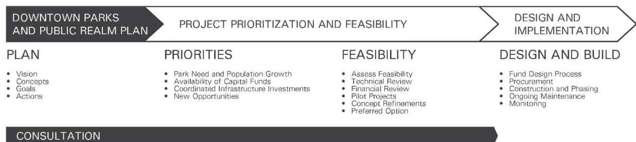
Figure 1: From Vision to Implementation

The Five Transformative Ideas are each supported by a number of initiatives that will inform a 25-year implementation strategy. These initiatives identify opportunities, and provide a vision for and explore concepts that are examples of the type of change that could occur. Moving from the vision and concepts illustrated in the Downtown PPR Plan to implementation will happen through a more detailed planning, design and implementation process, as set out in the graphic below. Each phase of the process will provide additional technical review and analysis, develop options for consideration, and will solicit further input and feedback from the community and stakeholders. The PPR Plan also promotes coordination among corporate and community partners for implementation.