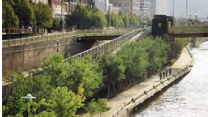
(right) Allegheny Riverfront Park seeks every opportunity to create an experientially rich pathway from an urban upper level down to a lower level park at the river's edge, Pittsburgh, United States