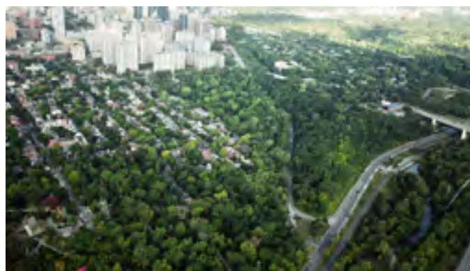
3. Bloor Street East – Potential 'Ravine Portal' Overlook and Access Passage at Parliament Street

In the centre, explore adding protected cycling facilities to the granite streetscape, and provide a generous and enhanced pedestrian realm that reflects the institutional and residential characters with street tree planting and landscaping in open planters where feasible.