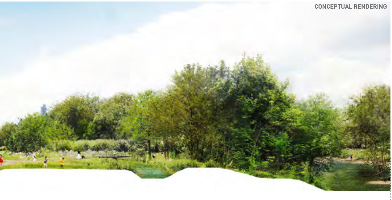
Don River Valley Park

When track rehabilitation occurs, work with Metrolinx to consolidate parkland and maximize the opportunity to create more space for pedestrians and cyclists and improve access to the future Don River Valley Park. Explore opportunities to create a linear riverside park