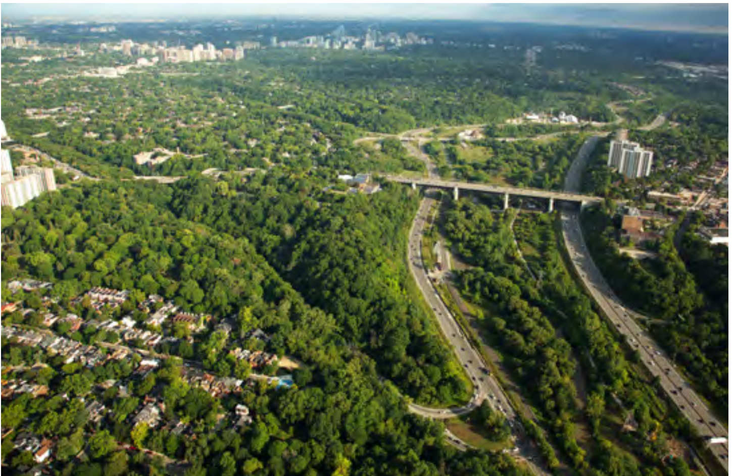
Bloor Street East – Potential 'Ravine Portal' Overlook and Access Passage to the Rosedale Valley and Don River Valley Ravine, Toronto, Canada