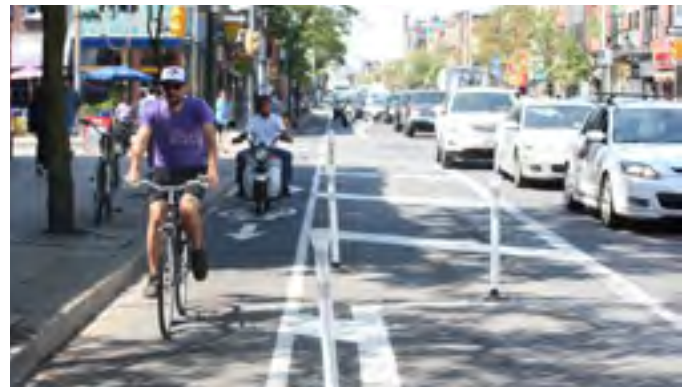
1. Bloor Street West – Permanent Protected Cycling and Enhanced Public Realm

The vision for Bloor Street recognizes the three established character districts of Bloor Street West, Central and East as the organizing structure of this primary civic spine.