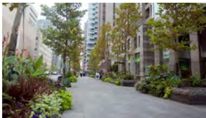
2. Bloor Street Centre – Streetscape Revitalization

In the centre, explore adding protected cycling facilities to the granite streetscape, and provide a generous and enhanced pedestrian realm that reflects the institutional and residential characters with street tree planting and landscaping in open planters where feasible.