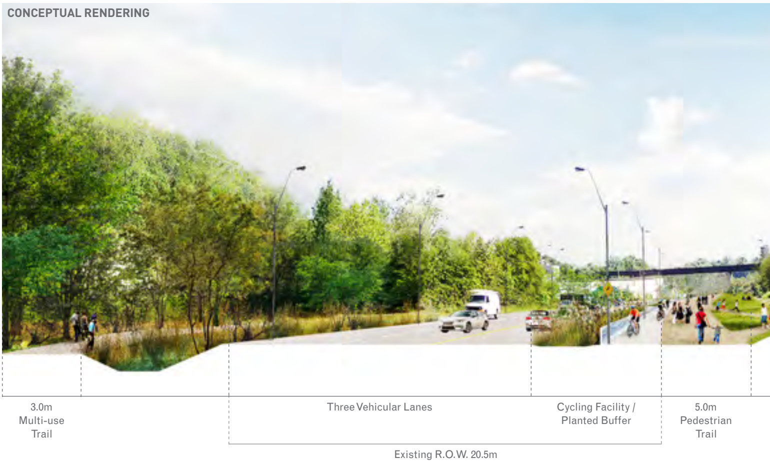
Bayview Avenue, looking north to Evergreen Brickworks, showing potential improved edge condition and access to the future Don River Valley Park with re-purposed space on Bayview Avenue and a re-aligned or elevated rail corridor, Proposed Concept

Recreate Bayview Avenue to enhance its Scenic Street character, reinforcing its riverside location and the spacious nature of the Don Valley and enhancing the experience of the surrounding natural environment and ravine landscape for all modes of travel including