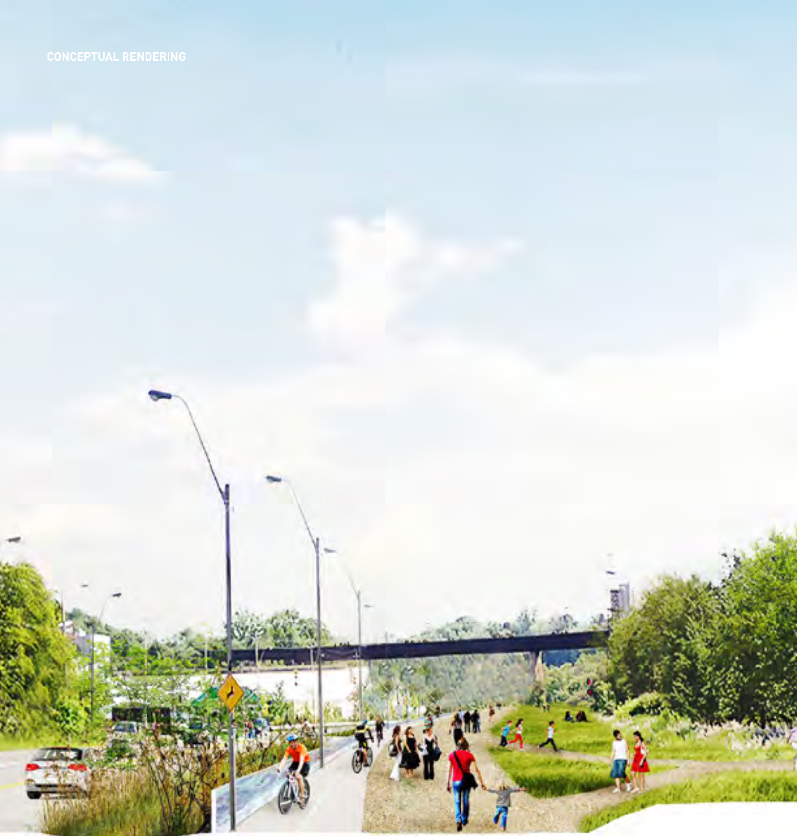
Bayview Avenue, looking north to Evergreen Brickworks, showing potential improved edge condition and access to the future Don River Valley Park with re-purposed space on Bayview Avenue and a re-aligned or elevated rail corridor, Proposed Concept