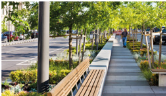
Lonsdale Street's transformation reflects the distinctive qualities of its setting, creating clear connections to each of the area's key public assets, a model for Jarvis Street in the Garden District, Dandenong, Australia