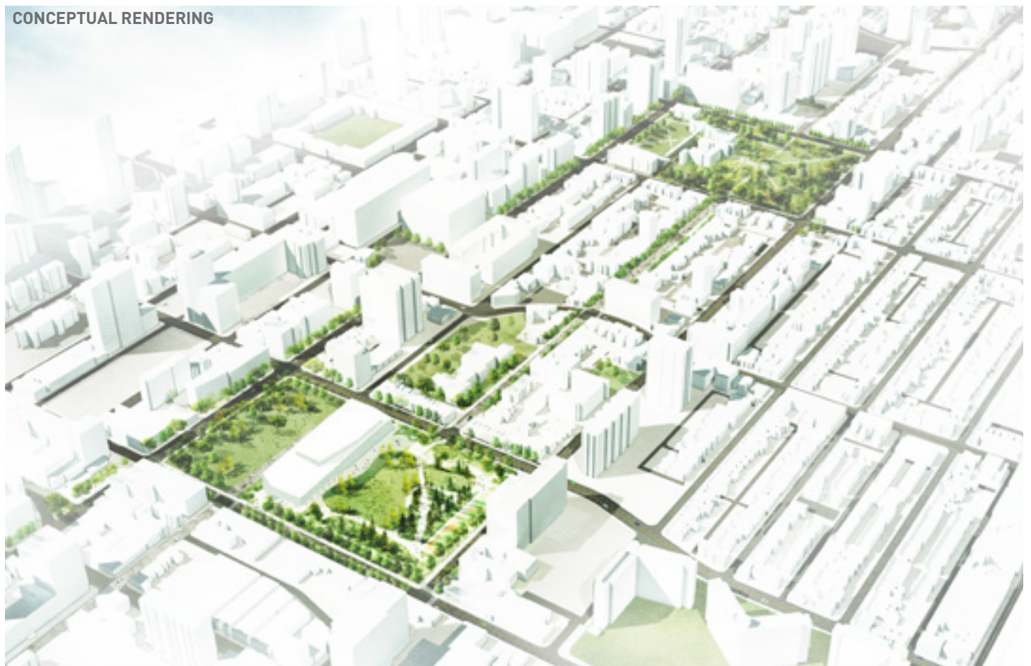
The Garden District, Proposed Concept

Imagine the Garden District's streets and surrounding parks and open spaces as a connected system where large, mature trees and immersive gardens can be experienced in the urban setting. Connect and green the district by blending streets with parks and