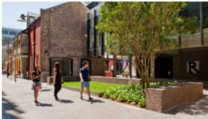
Kensington Shared Street, a model for Pembroke Street and Homewood Avenue as 'Green Links', Sydney, Australia

parking and limit street parking to reduce auto-related pavement and create green street edges. Improve the relationship between the pedestrian realm along park edges, providing an expanded pedestrian space, sense of relief and feeling of a 'street within a park'. Re-