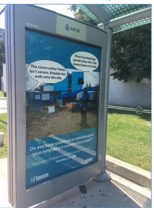
Illustration 3: Toronto Building Transit Shelter Advertisement

From July 17 to August 13, 2017, Toronto Building had advertisements placed in 100 transit shelters through the City of Toronto's agreement with Astral Media. As illustrated in Figure 4, the advertisement was intended to let people know that the toronto.ca/infill website was available should they have questions or concerns about construction in their neighbourhood.