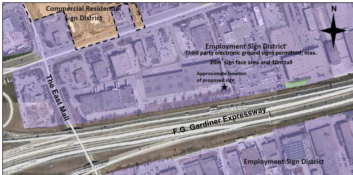
Figure 2 - Sign District Map Showing Proposed Sign Location and Surrounding Area

There are no existing third party signs located at the subject property, but there are two large third party electronic ground signs to the east and west, both within 500 metres of the proposed sign, and three other third party signs within 400 metres of the proposed sign (see Figure 4).