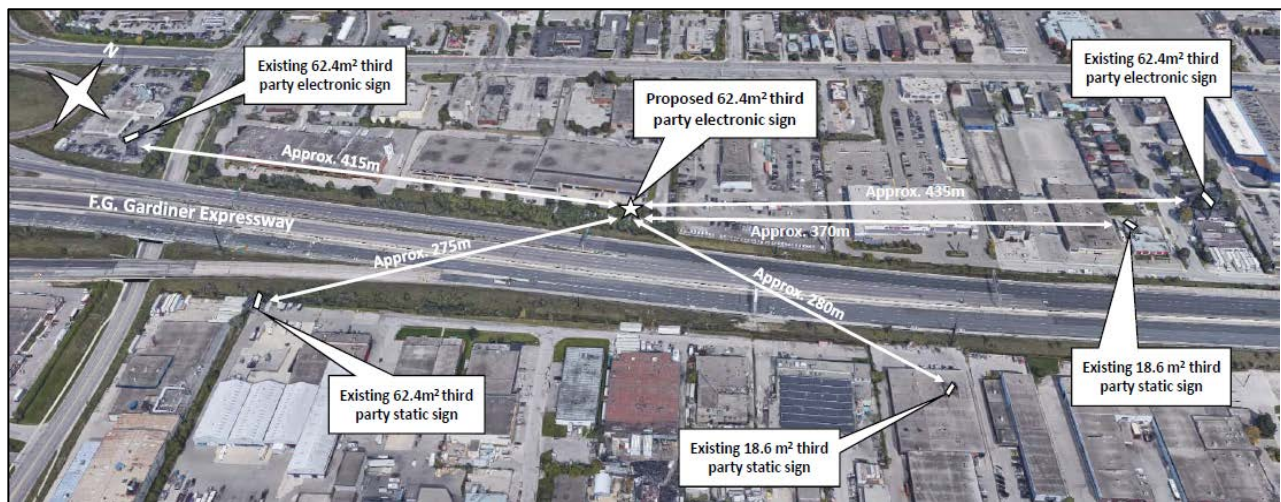
Figure 4 - Aerial Photo of Proposed Sign Location and distances to Nearby Third Party Signs (Distances are approximate)

As set out in the Sign Bylaw, notification of the proposed amendment was sent to all property owners within a 250-metre radius of the subject property, and a notice was posted at the property. The notice provides details of the proposed amendment and invites feedback by email, telephone or in person at a public meeting which was held on February 12, 2019 at the Etobicoke Civic Centre. No feedback was received.